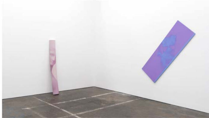
Installation view of 'Roman Women.'

In Roman Woman XI , at the gallery's entrance, a bright and piercing lapis offsets a crouching, life-size woman entirely cast in deep and ethereal violet. She's missing a portion of her head and both arms; she casts a shadow on her own thighs and gentle belly rolls. A thin purple strip along the left edge of the print hints at the meticulous coloring process.