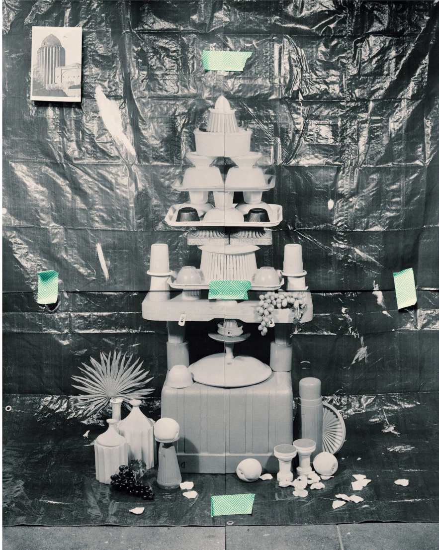
“Islamic Dome (Plastic Cups),” 2014.