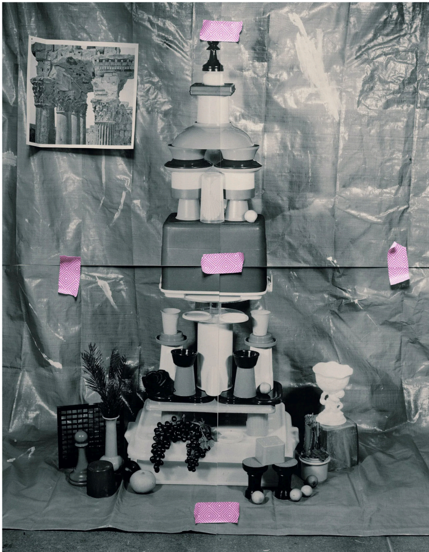
"Corinthian Column (Plastic Cups)," 2014.