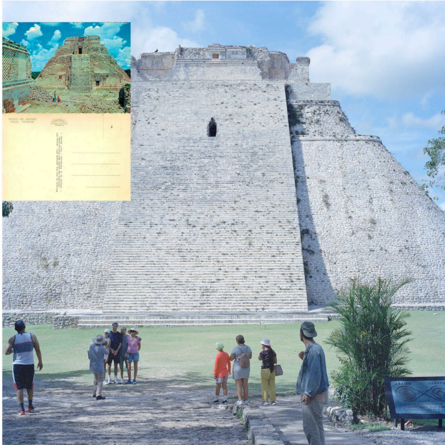
"Uxmal Ruin, Mexico (In Progress)," 2023.

"[This idea] plays into other themes of my work: If you have the picture of the thing, is it just as good as the thing? Or is it kind of the same to most people at this point? And is a photo an object? What does it do to blow it up and spend three weeks working on it in the studio in 2023?" she says.