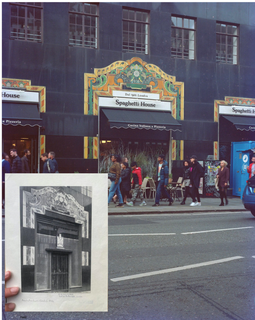
"Ideal House, London (In Progress)," 2023.

This epiphany became the flashpoint for Cwynar's new Doll Index series. In each composition, a patchwork of smaller pictures appears to cascade over a fashion-doll photo. Plucked from archival obscurity, the doll image, as a discrete background layer, creates the illusion of depth while visually anchoring a jumble of objects that are captured in the smaller images in the foreground.