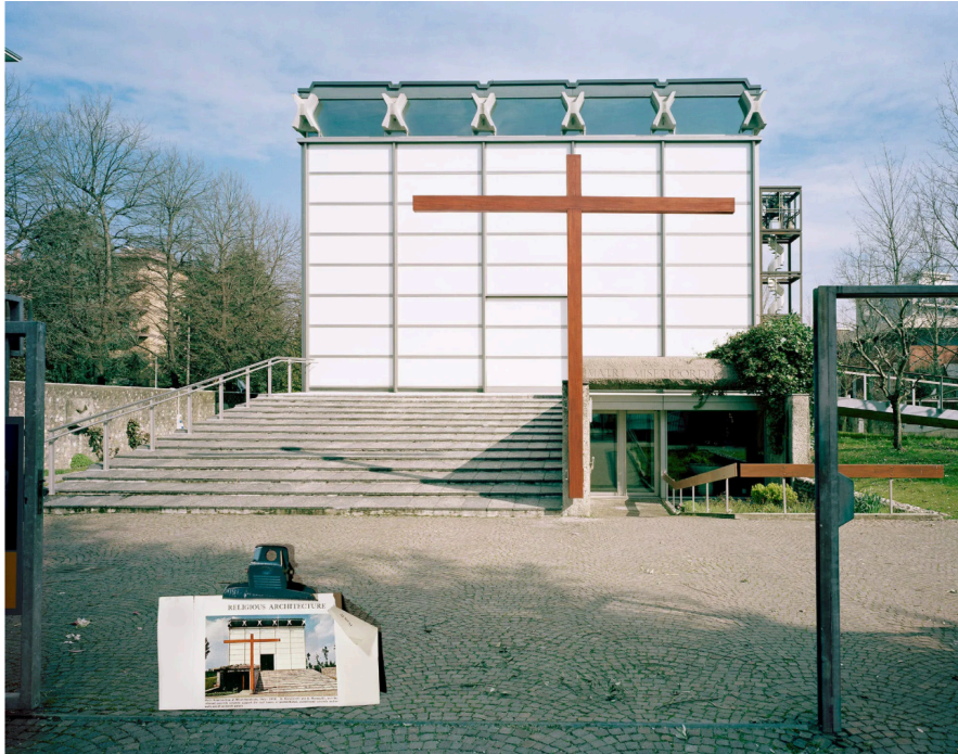
"Nostra Signora della Misericordia Church, Italy (In Progress)," 2023.