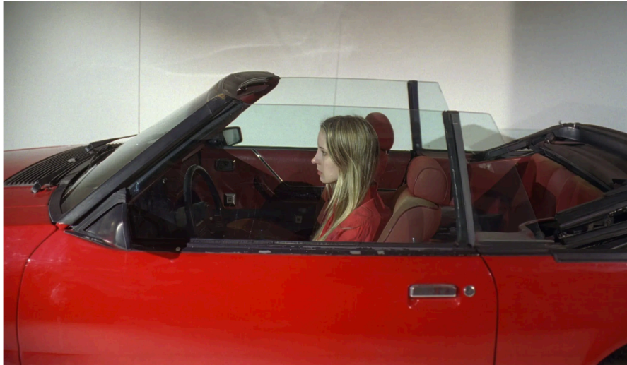
Still from "Red Film," 2018.

Last year, Dior asked the artist to put her own spin on the French house's iconic Lady Dior bag. Cwynar's two designs, which were released in November 2022, featured fixed grids of images—birds, crowns, lips, all from archival sources—on the quilted exteriors of two bags. That Cwynar's approach translates so seamlessly to an explicitly commercial endeavor is telling, especially to those otherwise quick to extrapolate a critical angle from her acknowledgment of the visual-consumer landscape: Cwynar surely reacts to the spectacle of all-encompassing imagery—but reactionary her work is not.