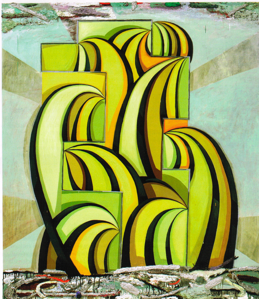
Rich History of Foul Ups 2008 Oil on board 152×122 cm

monuments to Allen himself, to his own age. Another trend, similarly taking the form of gilded but stranded monuments, is for stacks of three-dimensional letters: WXY ' (2008), for instance. Again the sense of an ending inheres, but the letters are arranged to create the schematic shape of a female figure (there's also a male version from the same year, OMN ), an optical trick Allen learned in the pub; it's a body if you want it to be. And, while we're considering what or whom might be at the heart of this work, one more title: 'Pareidolia', for a series of recent collages in which, on small sheets of board, messy grids of Allen's signature paint-whorls serve as frames for central images – bearded commissioners toting flowers, moon-walking astronauts, smiling nude figures from National Geographic . What do these subjects have to do with the extrusive, gaudy abstraction that blooms around them? What do they have to do with each other?