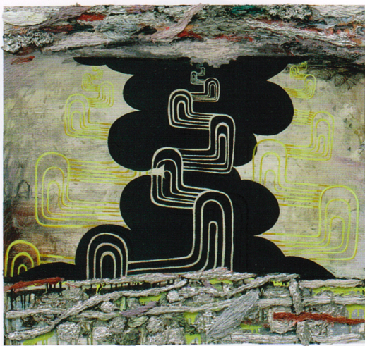
Postopia 2008 Oil on board 76×81 cm

precisely counterbalances the landscapes' inhuman mood, leaving them irreducibly compounded: happy/sad, friendly/threatening. Other manifestations in other paintings, particularly those made in the last five years, less resemble fixed objects than energetic fields: the spilling cloud of pastel-coloured kite shapes that floods Interzonal Level Sequence (this is just a test version) (2006), the floating speech balloons in black, blues and tan of Second Ace Worry (international version) (2004). The latter shapes seem lifted from 1950s graphic design, and a fair amount of Allen's production elsewhere takes what ought to be two-dimensional forms, often loosely reflective of 20th-century abstraction and its extension into applied art, and agglutinates them into freestanding solidities or at least embeds them in implied depth. Connectedly, here are some more titles: Intentionally Clumsy ; Little Moments of Small Joy ; Sloppy Cuts No Ice ; Rich History of Foul Ups ; Pinnacle Mind Hell ; Postopia ; The Falestorm . Things have gone wrong, such appendages might imply, albeit possibly the collapse has its own consolations; and we are here, after the end. Is Allenland a purgatory of sorts for the syntactical elements of modernism, a place where these forms and gestures, deathless but not lively, nevertheless retain the residual energy to combine themselves into monuments to their own obsolescence? Is Allen, in short, one of those artists, a glib attendant at the wake?