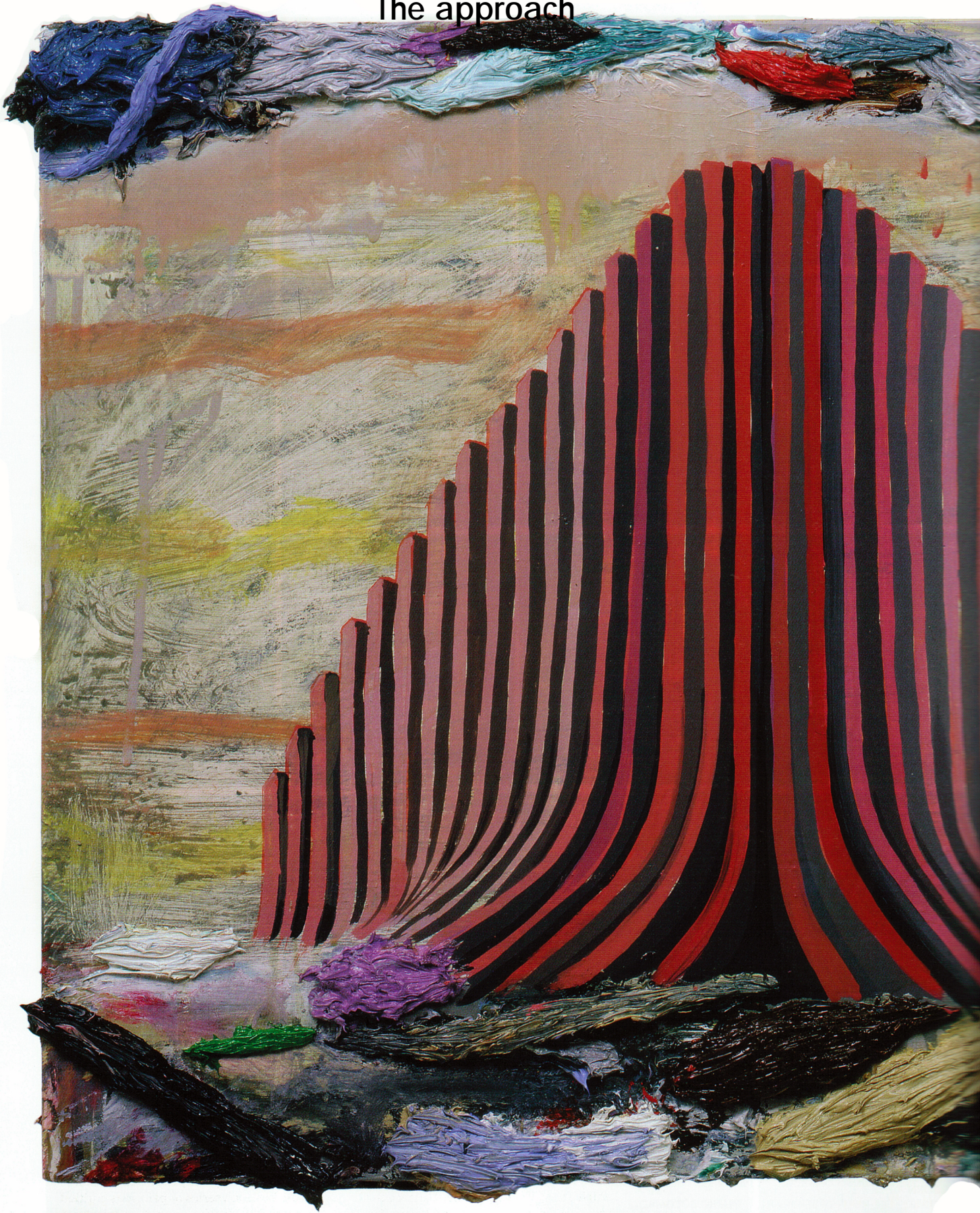
Volume Champion 2008 Oil on board 41x51 cm