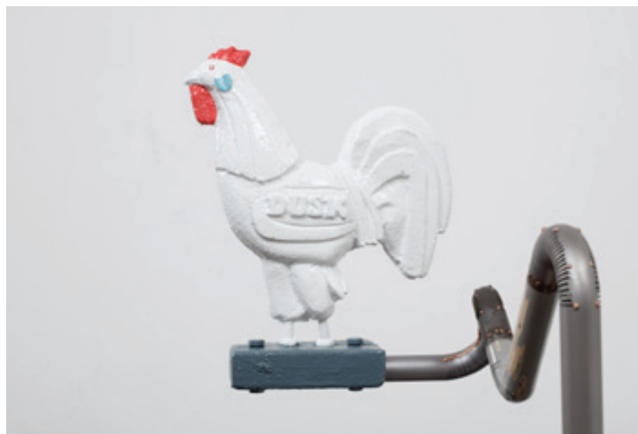
(above) Apricots (detail), 2021. Courtesy: the artist, The Approach, London and Fons Welters, Amsterdam. Photography: Robert Glowacki