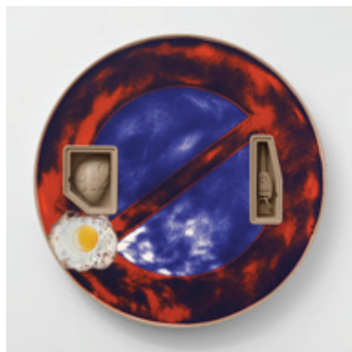
(above) Parking (Bench Press) , 2014. Fibreglass, polyester resin, pigments, laser cut and powder coated aluminium, steel springs, bungee cord, 57x182x49 cm. Courtesy: the artist and The Approach, London. Photography: Plastiques