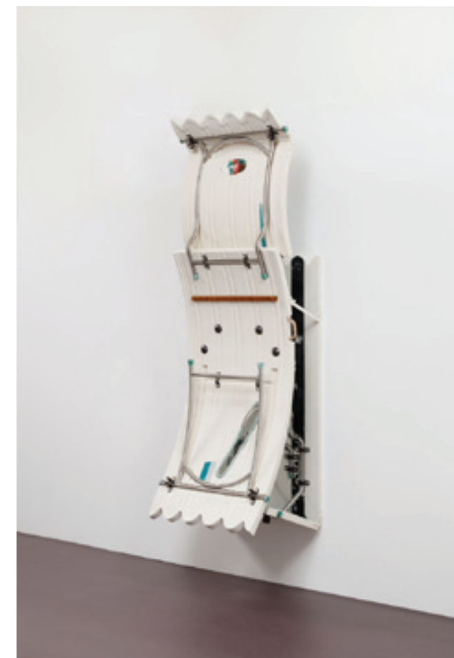
(right) Bonelight (Autumn Glory) , 2020. Fibreglass and polyester resin, pigments, awning fabric, brushed stainless steel, sprayed UV printed resin, powder coated cast iron, carved stained wood, air brushed laser cut steel, nuts and bolts, 232x73x69 cm. Courtesy: the artist, The Approach, London and Fons Welters, Amsterdam. Photography: Lewis Roland