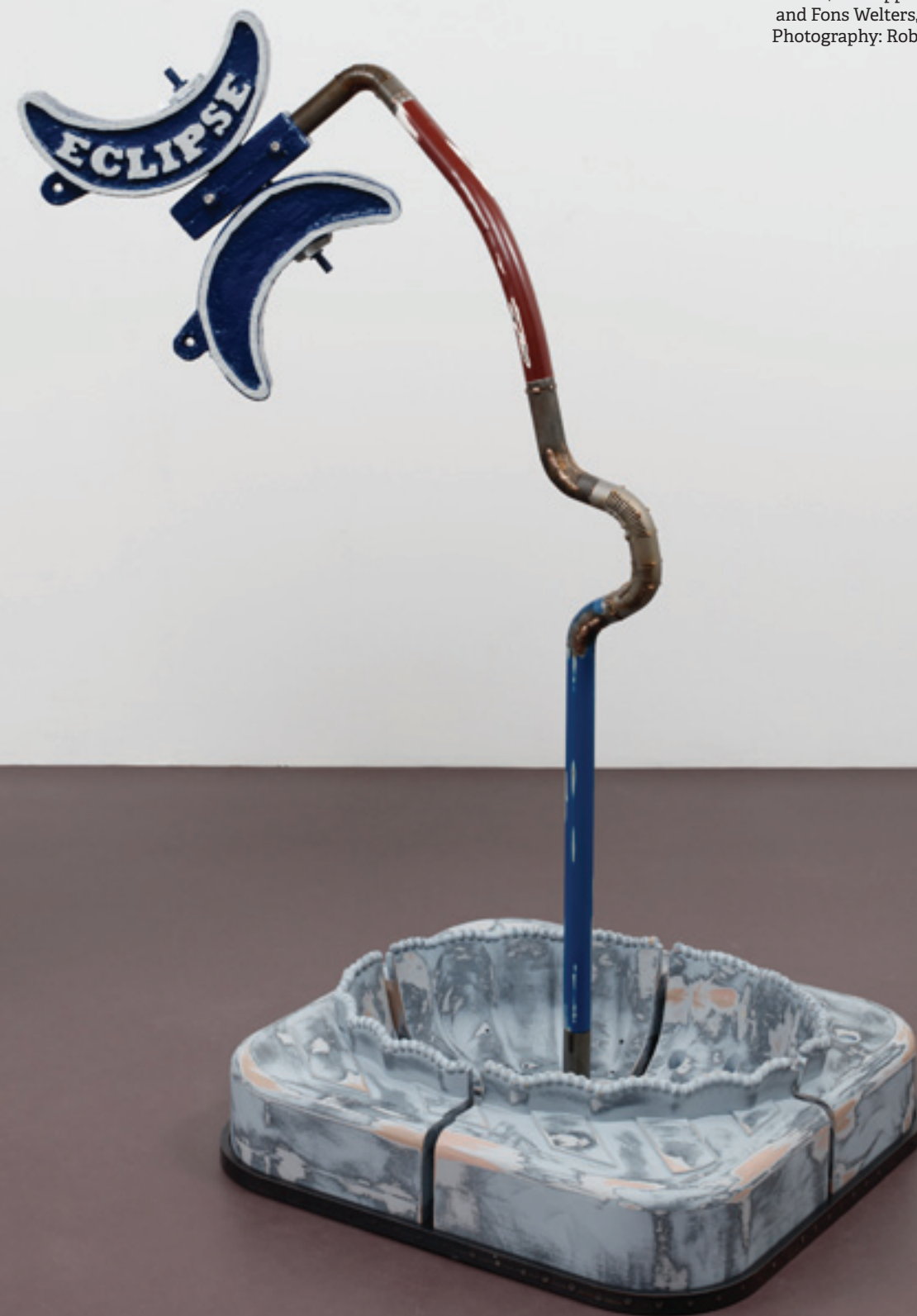
Hammock , 2021. Sand cast and hand painted aluminium, CNC'd and sprayed model board, powder coated, phosphated, sand blasted, blackened and copper welded stainless steel and mild steel, nuts and bolts, 128x82x61 cm. Courtesy: the artist, The Approach, London and Fons Welters, Amsterdam. Photography: Robert Glowacki