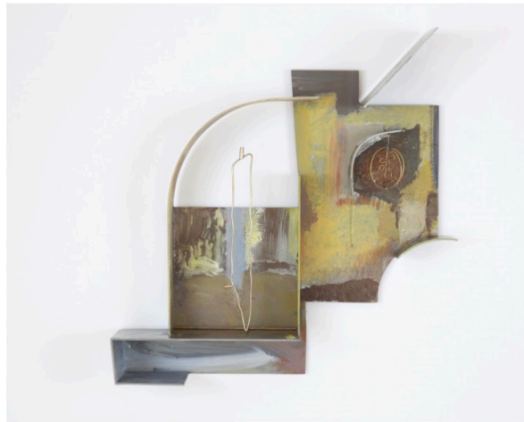
Sara Barker, mouth , 2020. Courtesy the artist and Cample Line. Photography by Mike Bolam.

were exiting the frame. It seems like an intuitive formal extension of painting rather than a sculptural process incorporating brushwork. And much of the emotional and cognitive sense is carried by the background scene. We can almost see shallow hillsides, dry-stone walls, beaches (unable to visit the gallery in the early stages of preparation for the show, Barker searched online for images of the nearby landscape). Bodies, anonymous but familiar-seeming, rise up from scratchy patches of colour in toy and BUNKER —Barker’s obvious skill as a figurative painter is vital in ensuring that these hints stick in the mind.