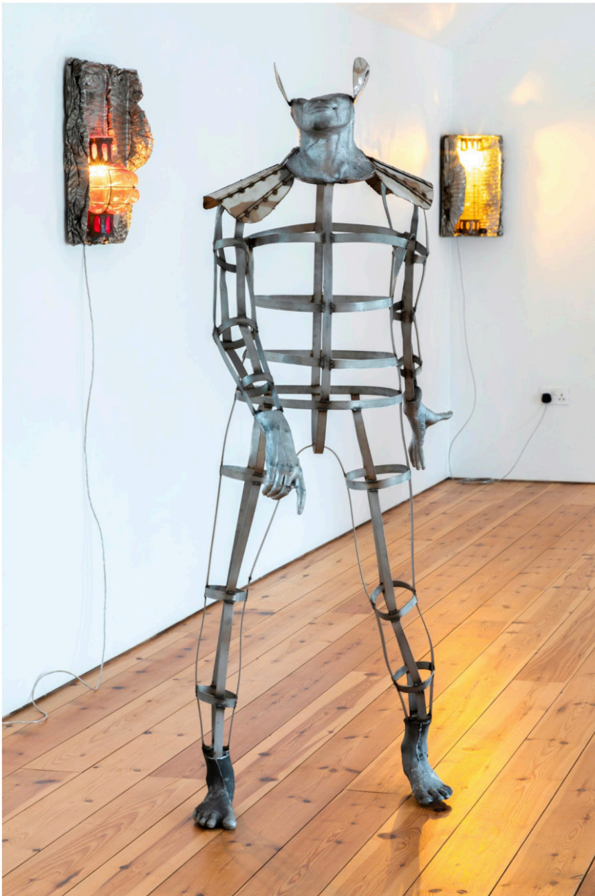
Moving towards the calm one, whose arms open, the breadth of happiness in measurable form, 2021. Stainless steel and cast aluminum, 166 x 67 x 85 cm.

they can get better and be more powerful. They are cast from life, especially the faces. You can't cast with open eyes, so all of their eyes are closed by necessity. It's not something I ever notice, though I think about it when I'm casting, and I wonder if there will be a time when I either construct the faces myself (which I've done before with clay, then cast) or chisel out the eyes in a classical way so there is a void. But I love the way they function at the moment because they are all in some kind of devotional state, though it's unknown whether that's blissful contemplation or fear. They often swing between those states, and there is often a sense of things crashing down.