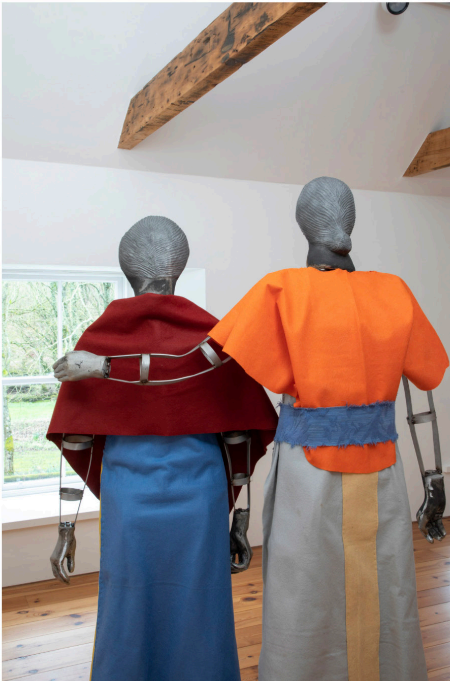
fireworks , 2022. Stainless steel, cast aluminium, wool, and felt, 180 x 135 x 56 cm.

BW: What's your favorite work in the Cample show?