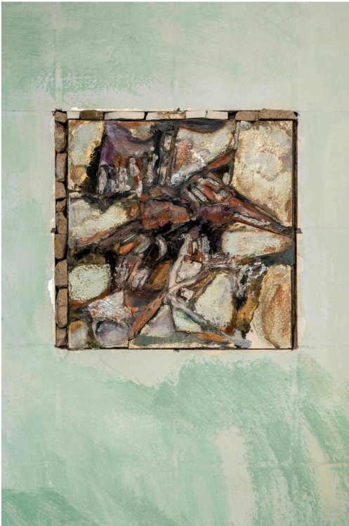
Sara Barker, Grotto (2023). Wall recess, tiles, mortar, paint, tinfoil, rubble. 31 x 31 x 3 cm.