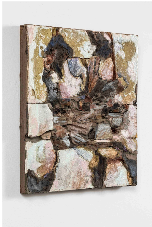
Sara Barker, Oxford House (2023). Tiles, mortar, paint, wood. 33.5 x 29 x 4.5 cm. Courtesy the artist and Patricia Fleming Gallery, Glasgow. Photo: Keith Hunter.