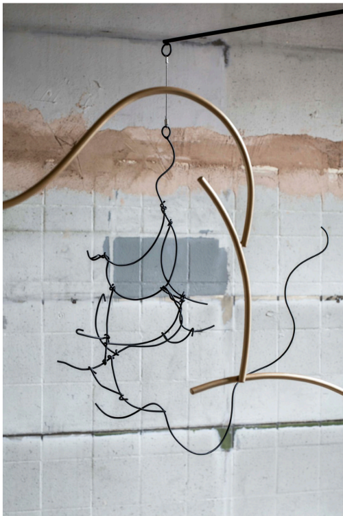
Sara Barker, Reenactment (2023) (detail). Stainless steel, paint, mobile fixings, wire. Dimensions variable.