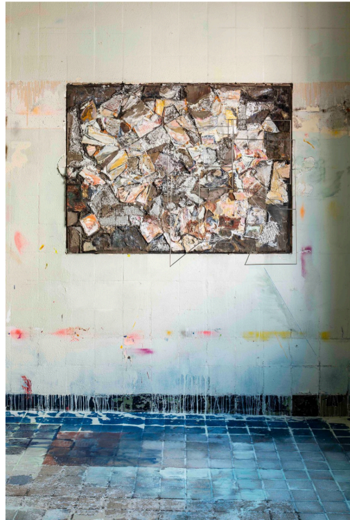
Sara Barker, Paraphernalia (2023). Wall recess, tiles, mortar, paints, silver foil, stainless steel. 103 x 107 x 8 cm. Courtesy the artist and Patricia Fleming Gallery, Glasgow. Photo: Keith Hunter.