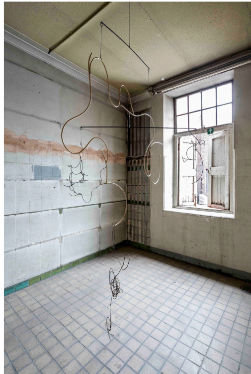
Sara Barker, Reenactment (2023). Stainless steel, paint, mobile fixings, wire. Dimensions variable. Courtesy the artist and Patricia Fleming Gallery, Glasgow. Photo: Keith Hunter.