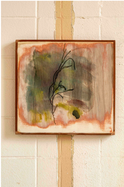
Sara Barker, Blotch (2023). Wood, watercolour paint. 38 x 40 x 3 cm.

From broken tiles to blistering paint, Sara Barker incorporates the materials of dilapidated interiors in her paintings, installations, and sculptures.