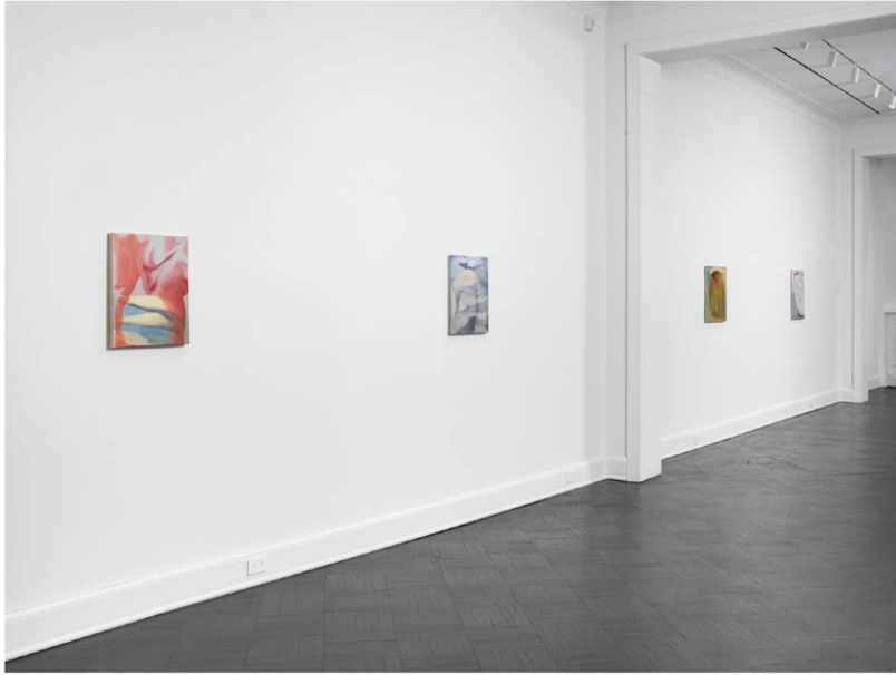
Soft Sun (installation view), Petzel, New York