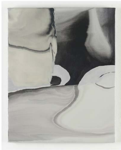
Proximity , 2021, oil on canvas, 21.65 x 17.32 inches

When I paint, I allow a lot of things to happen. I do not want to impose too much on the image as it unfolds. I do not use a sketch or anything like that in advance. A preconceived image would get in the way of my direct connection to the paint. I need the painting to keep changing once I start out, to find the right direction. In this process, I find shapes that seem uncertain about their identity. They could be this but also that – there is a dynamic quality in their appearance that I want to transmit. Often the final form of the painting comes in a flash – I see it at once. To reach that, the painting goes through a lot of stages, until the paint starts to become alive. Whereas in an illustration, the image tries to express one idea in precision, I look for the opposite, for openness and ambiguity. It is not just one thing that is depicted. It is rather a situation in movement. It is everything at the same time: figure, portrait, landscape.