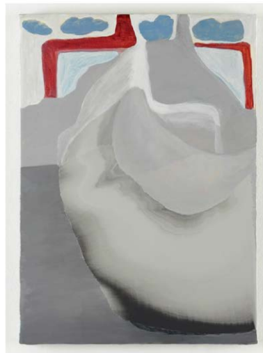
Comfort, 2021, oil on canvas, 23.62 x 16.93 inches

From a conceptual viewpoint, it seems that movement and ambiguity are at the heart of your practice. How does technique come into the process? The forms in your work have a natural appearance; things seem to flow as if it all just happens organically. But it is probably not that simple to make things look so easy.