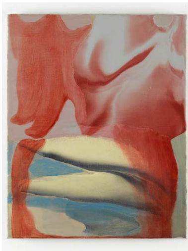
Long Distance, 2021, oil on canvas, 19.69 x 15.75 inches