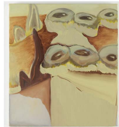
Gossip, 2021, oil on canvas, 21.65 x 18.9 inches

How do you feel as a painter in the current context, where most people are used to the daily consumption of digital images? What is the drive to work with paint at this moment in history, also considering the abundance of photographic images that surround us?