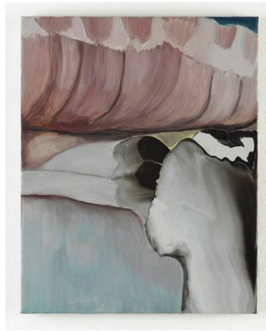
Untitled (Support) , 2021, oil on canvas, 19.69 x 15.75 inches

You look for openness, but the hints of figuration are important in your work. How specific does a painting need to be for you, in order for it to “work”? Does it need a relationship with the world as you can observe it? Or could it also be a fully abstract play of forms?