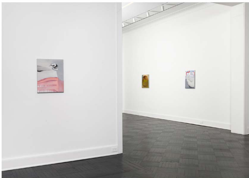
Soft Sun (installation view), Petzel, New York

I am not sure if it is desirable. I suppose it could be different in other cultures, where the individual is not as celebrated, but of course every painter is present in the work even if they don't want to be. It is like music: you like a voice or sound, and it makes you feel good, like there is an understanding. The encounter is abstract; it is about meeting through a shared language.