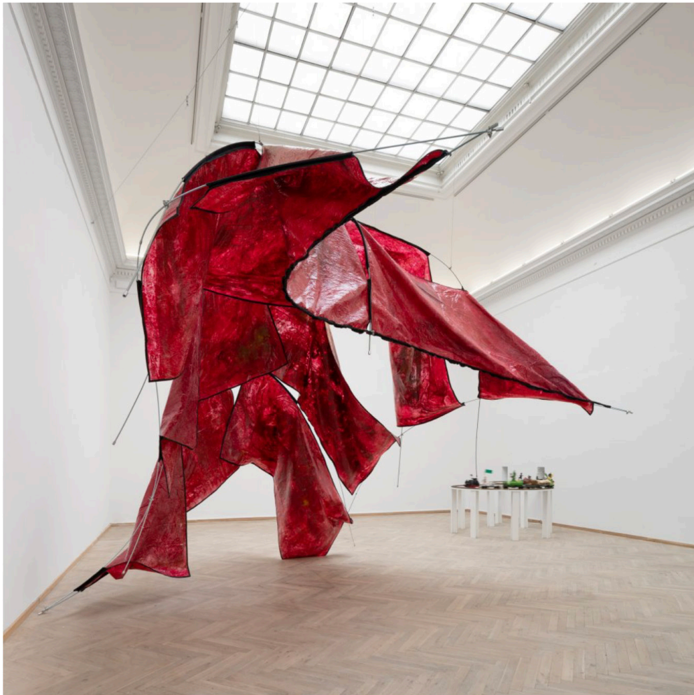
Ghosting (2019). Installation view of "Witch Hunt," Kunsthal Charlottenborg, Copenhagen, 2020.