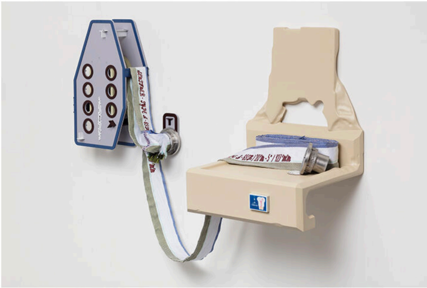
Magali Reus, Sentinel (Bow and Shoulder) , 2018, sprayed fibreglass and polyester resin, pigments, air-brushed aluminium, embroidered custom-weave viscose, polyester and cotton, sand-cast aluminium, laser-engraved leather, cotton twine, powder-coated aluminium, 1.6 × 1.4 m.

'burned engraved wood' and 'upholstered, woven, braided, natural and dyed leathers and suedes' (amongst other things). There are a lot of verbs – volumes of congealed time and labour – implicit in those descriptors.