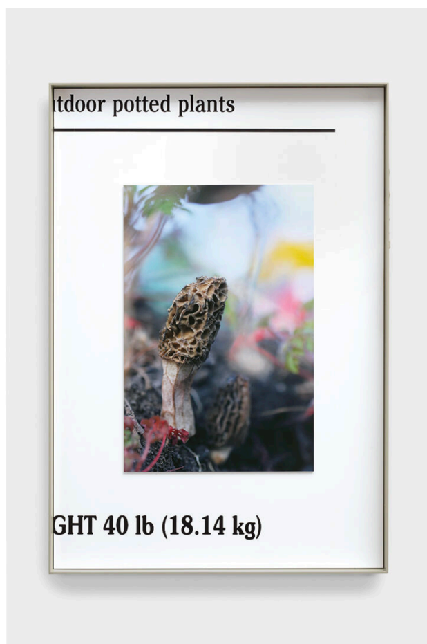
Magali Reus, Knaves (Shadow Tonics) , 2021, C-print on aluminium, powder-coated steel, welded and powder-coated aluminium, 85 × 60 cm. Courtesy: the artist and The Approach, London and Fons Welters, Amsterdam. Photograph: Mark Dalton

history and taxonomy of the distinctively shaped counterbalances seen on farms across the US in the 19th and early 20th centuries. Used to stabilise vaneless windmills, the iron forms served as a kind of maker's mark, performing not only a decorative but a marketing function. Borrowed from the book and re-cast in aluminium, two cockerels, a buffalo and a pair of conjoined crescent moons crown a series of four free-standing sculptures that will be exhibited in Dallas ( Grain of Wind , Hammock , Apricots and The Greenest Grass , all 2021). Their perches stand, like spaghetti-warped sun-umbrella poles, in model-board bases with a cheap plastic mien. They make me think of the beach bars of my childhood summer holidays: white plastic chairs sinking into the sand and candy-striped umbrellas with ice-cream-brand logos. Juxtaposed with the Americana windmill weights' nod to agricultural history, these works evoke the great outdoors as a site of leisure as well as industry.