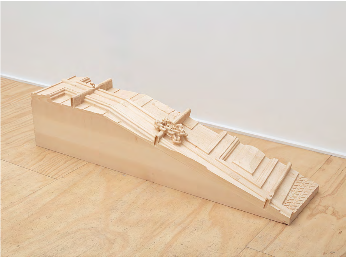
Magali Reus, Visitor (39 Gt Jns St) , 2019, carved hemlock, 42 × 42 × 180 cm.

The gallery's numerical address (39) is carved into the wood upside down, such that I initially misread it as a GE logo. Fittingly, I also mistook the nearby 'Empty Every Night' series for lamps; these sculptures seem to shape-shift between suggestions of different bedside furniture. The series's titles reproduce the literal command to get rid of one's rubbish, but they also convey a more human void (a subject who finds herself empty, nightly). Fabricated via a combination of casting, carving, 3D modelling and printing, and made of fibreglass, polyester resin, pigments, powder coated steel rod and aluminium, plywood, C-type print, acrylic, et al., these sculptures are uncanny: they leave you on the edge of recognizing their form.