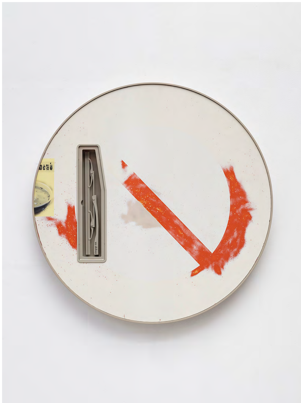
Magali Reus, Settings (Fire Flies) , 2019, Powder coated and airbrushed steel, aluminum, sprayed UV printed resin, acrylic, grub screws, 71 × 71 × 5 cm. © Magali Reus; courtesy the artist and Galerie Eva Presenhuber, Zurich / New York; photograph: Lewis Ronald

panel. Inside the container, twists of steel intertwine to suggest something electric: from this view, it is a silent alarm clock, one that commands you to stay in bed. Downstairs, the other three from this series pair the tray with a jagged block, rather than a bin, at once a pillow and a weight.