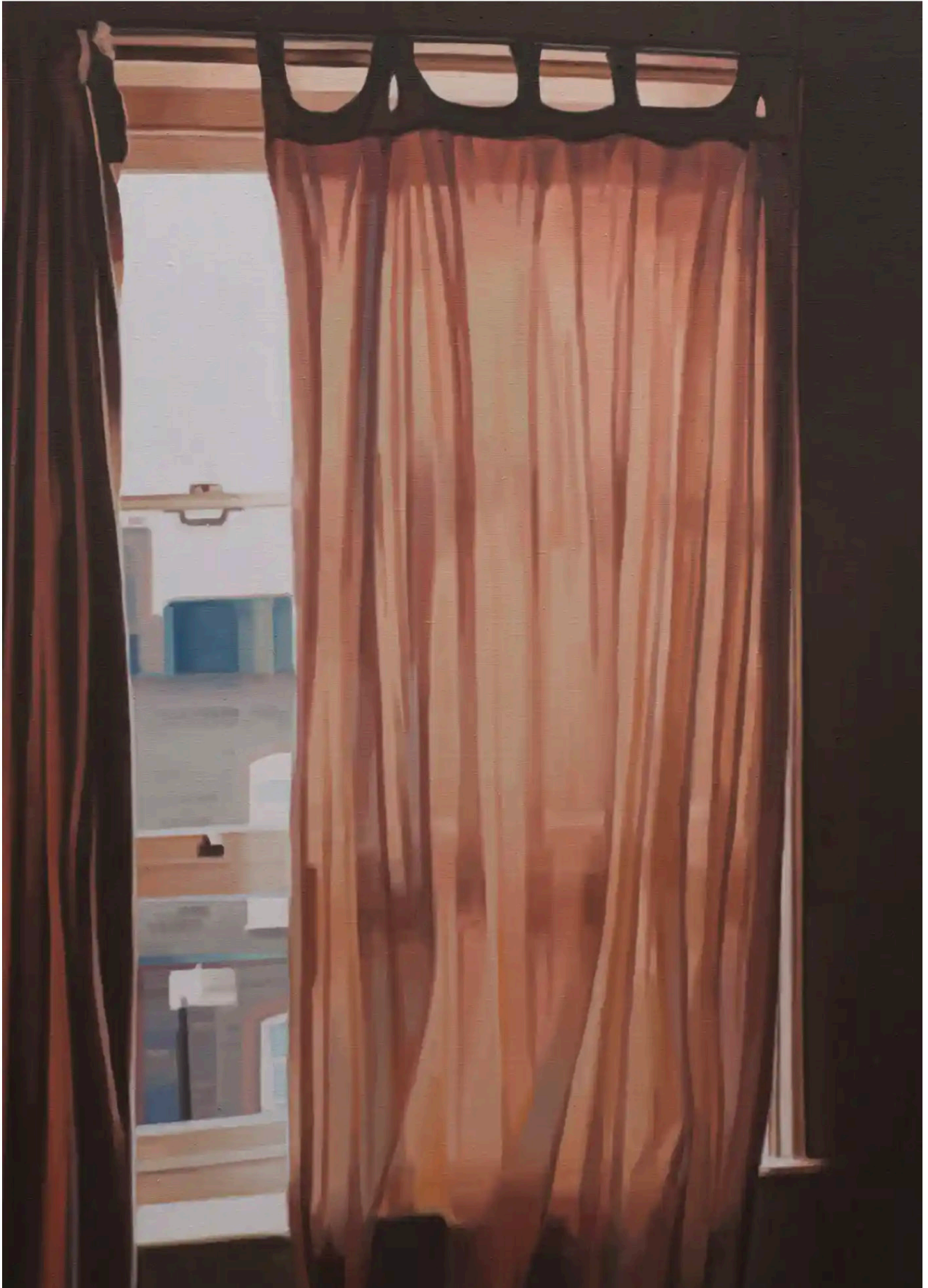
📷 Owens Room (2023) by Mike Silva.