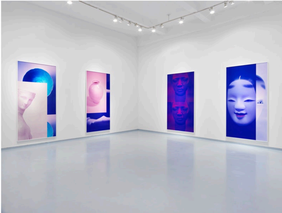
Installation view: Sara VanDerBeek: Women & Museums , Metro Pictures, New York, 2019.