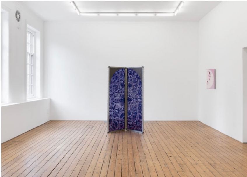
Installation view: Sara VanDerBeek: Lace Interlace , The Approach, London, 2023.

I tried to synthesize all of this into these new works that I think of as screens. Each is titled Lace Interlace , and they're paired and arranged in a site-responsive manner in the gallery. They contain architectural references and references to the layering of images specific to the guard books as well as the Victorian use of shaped mats. But they also try to translate the variety of textures, material experiences, and details that I was photographing during my overall research process. They're toned in colors related to the albumen prints Cowper and Cameron made and they have a strong focus on pattern inspired by lace.