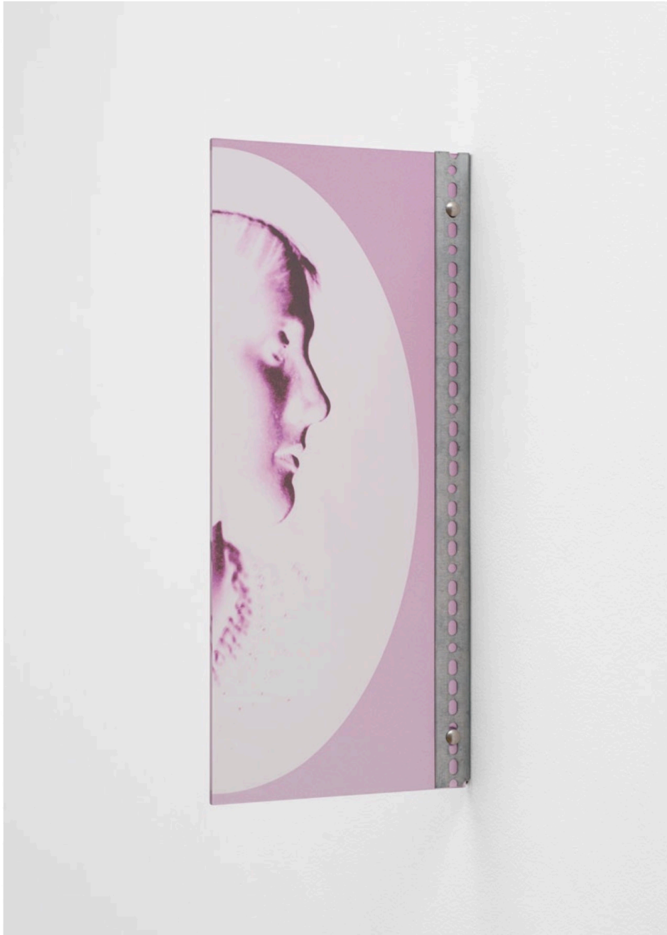
Sara VanDerBeek, Mother , 2023. UV Print on Plexiglas, Zinc Plated Steel. 24 x 10 in. Courtesy the artist and The Approach, London. Photo: Michael Brzezinski.

Rail: Mediation seems to be one of your primary subjects.