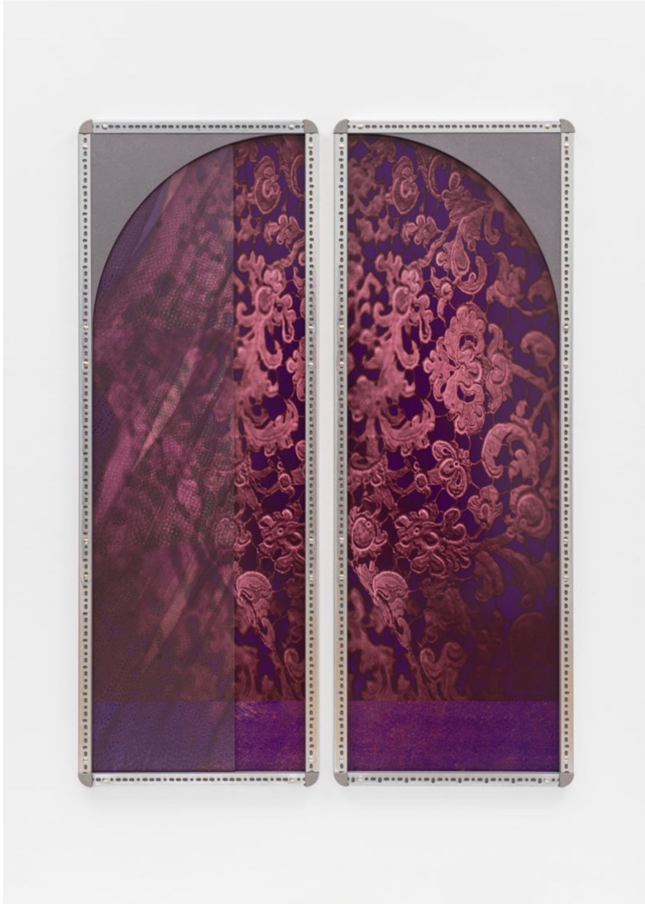
Sara VanDerBeek, Lace Interlace V , 2023. UV Print on Plexiglas, Dye Sublimation Print mounted on Aluminium, Valchromat, Zinc Plated Steel. Diptych. Overall dimensions: 75 x 55 15/16 x 1 3/4 inches. Each screen: 75 x 27 x 1 1/2 inches. Courtesy the artist and The Approach, London. Photo: Michael Brzezinski.