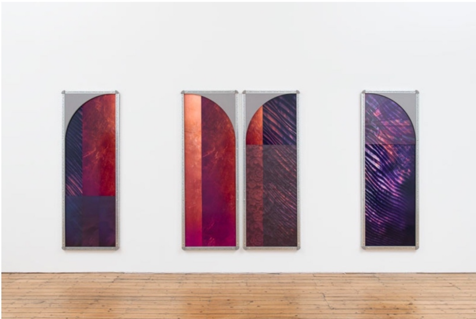
Installation view: Sara VanDerBeek: Lace Interlace, The Approach , London, 2023.

The Garden , a pendant exhibition organized by VanDerBeek, features her own work alongside that of three recently deceased artists whom she counts as inspirations. The theme of the garden, as a space for both reflection and creation, unites a photograph by Sarah Charlesworth, a video by Shigeo Kubota, and a drawing by Rosemary Mayer.