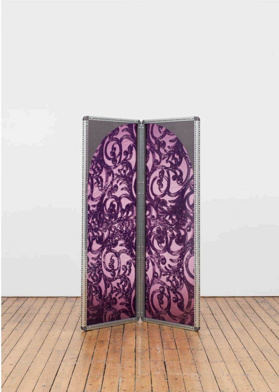
Sara VanDerBeek, Lace Interlace VII , 2023. UV Print on Plexiglas, Valchromat, Zinc Plated Steel Diptych (floor standing screen) Overall dimensions: 75 \frac{3}{16} x 40 \frac{15}{16} x 22 \frac{13}{16} in. Each screen: 75 x 27 x 1 \frac{1}{2} in. Courtesy the artist and The Approach, London. Photo: Michael Brzezinski.