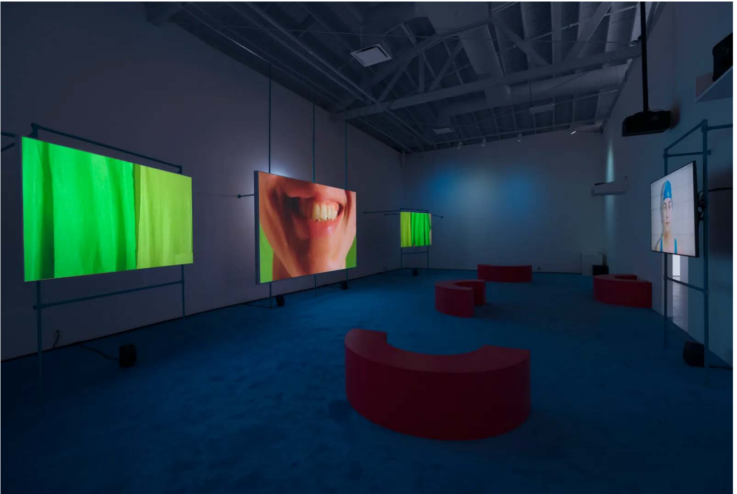
Sara Cwynar, Glass Life , 2021. Six channel 2K video with sound, TRT: 19:02 min. Courtesy the artist; The Approach, London; Cooper Cole, Toronto; and Foxy Production, New York. Installation view, Sara Cwynar: Apple Red/Grass Green/Sky Blue , Institute of Contemporary Art, Los Angeles, February 5–May 29, 2022. Photo: Jeff McLane/ICA LA

Outdatedness is central to Soft Film (2016), in which Cwynar contemplates the afterlife of objects. She takes the velveteen jewelry box as its starting point, stacking the glamorous objects in columns and stroking their plush, time-faded exteriors with probing fingers. The boxes originally functioned as signifiers for the more expensive items held inside. Now they're sold on eBay or Etsy as collectible objects in their own right. But who collects them? Cwynar, for one (the narrator croons, "I can't sleep so I comb eBay"). What is their meaning (if any)? Their value (if any)?