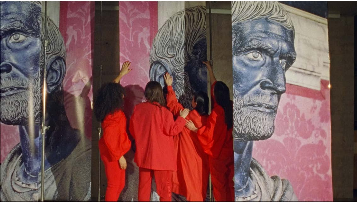
Sara Cwynar, Red Film (video still), 2018. 16 mm film transferred to video, TRT: 13 min., installation dimensions variable. Courtesy the artist; The Approach, London; Cooper Cole, Toronto; and Foxy Production, New York. All works © Sara Cwynar.

In Red Film (2018), a group of dancers in monochromatic red outfits undulate in front of printed works of Western art. “Cezanne. Susan. Matisse,” the narrator drones, as pieces of makeup glide through a factory, a woman in bright red lipstick pouts, and a hot red 1980s convertible sits parked in a studio. Red is a color associated with beauty, the film argues, an inherited notion that’s sold back to us constantly through cosmetic and luxury items.