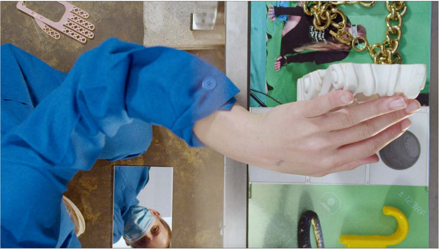
Sara Cwynar, Glass Life (video still), 2021. Six channel 2K video with sound, TRT: 19:02 min., installation dimensions variable, edition of 3 + 2 APs.

Sara Cwynar: Apple Red/Grass Green/Sky Blue marks the New York-based Canadian artist's first exhibition in Los Angeles. Glass Life is one of four recent video essays in the show, and each work tackles a unique aspect of imagery and its consumption under capitalism. But they're all unified by similar questions: can the world be understood through its objects? Its pictures? Its data? Its add-to-cart popups?