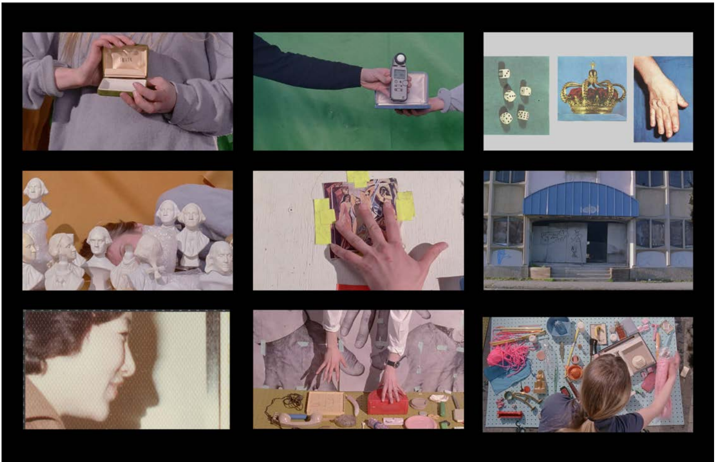
Sara Cwynar, Soft Film (video still), 2016. 16 mm film transferred to video, TRT 8:00 min., installation dimensions variable.