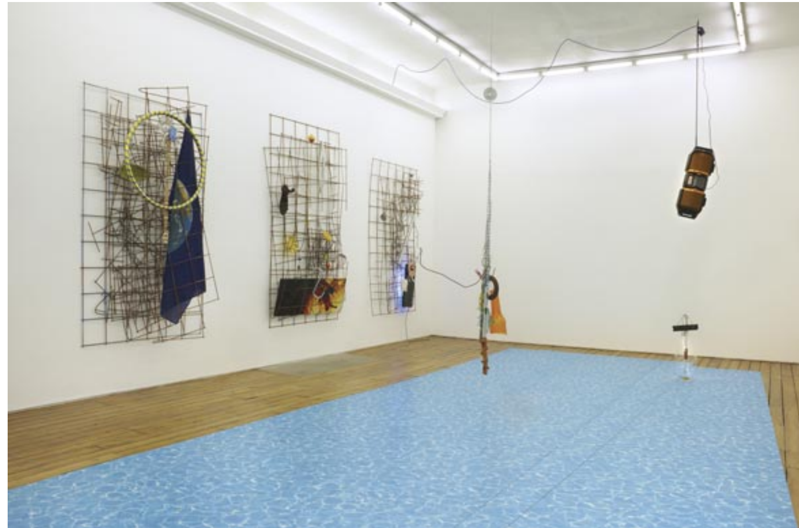
Dreams Chunky, installation view at The Approach, 2013

(J.L.) You can know something's bad but you still seek it out. Then you want to counterbalance it with something really good or healthy. It's hard to balance these fundamental things, fast food, and healthy food, getting drunk. There are things you strive for, things you want, and things you need. Above all, for me, I feel a need to be in nature. At the moment it seems I can't escape images of nature, especially in advertising. How does surrounding yourself with images of nature affect your mood? In my studio there are cheese plants, money plants, ivy and, in the middle of it all, a fake ivy. But when I'm working, it's hard to distinguish between the fake and the real even though I know one's fake. It's funny how the fake ivy is so convincing and such a mood-changer. I'm not sure if convincing is the right word though; the fake ivy can just put me at ease.