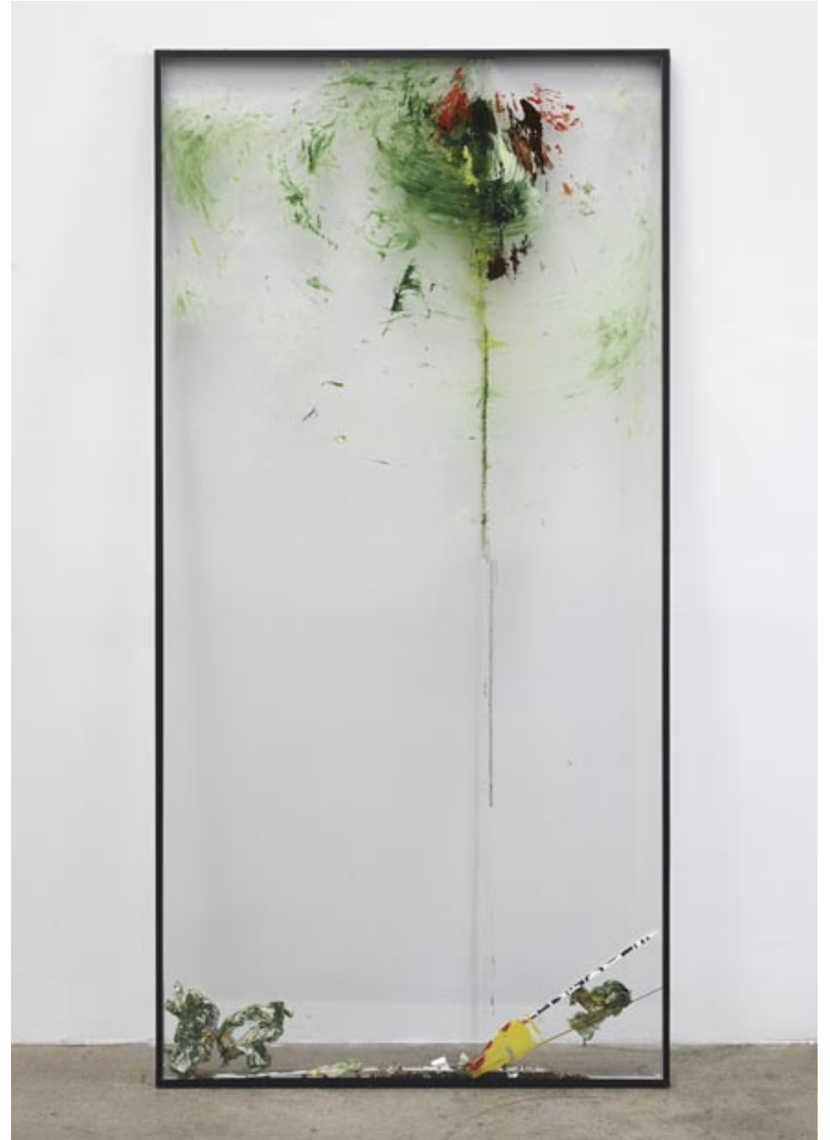
Walking Home 8 , 2014 Glass, mixed media 180 x 90 cm next page : Glistening Echoes of a Slow Walk Home (detail)