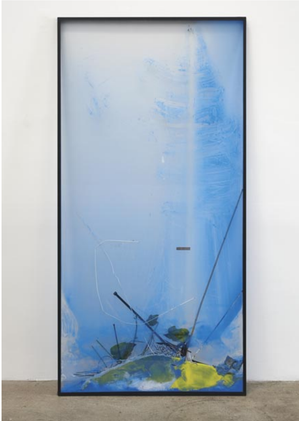
Walking Home 13 , 2014 mixed media 180 x 90 cm previous page : Glistening Echoes of a Slow Walk Home, installation view at Mihai Nicodim Gallery, Los Angeles