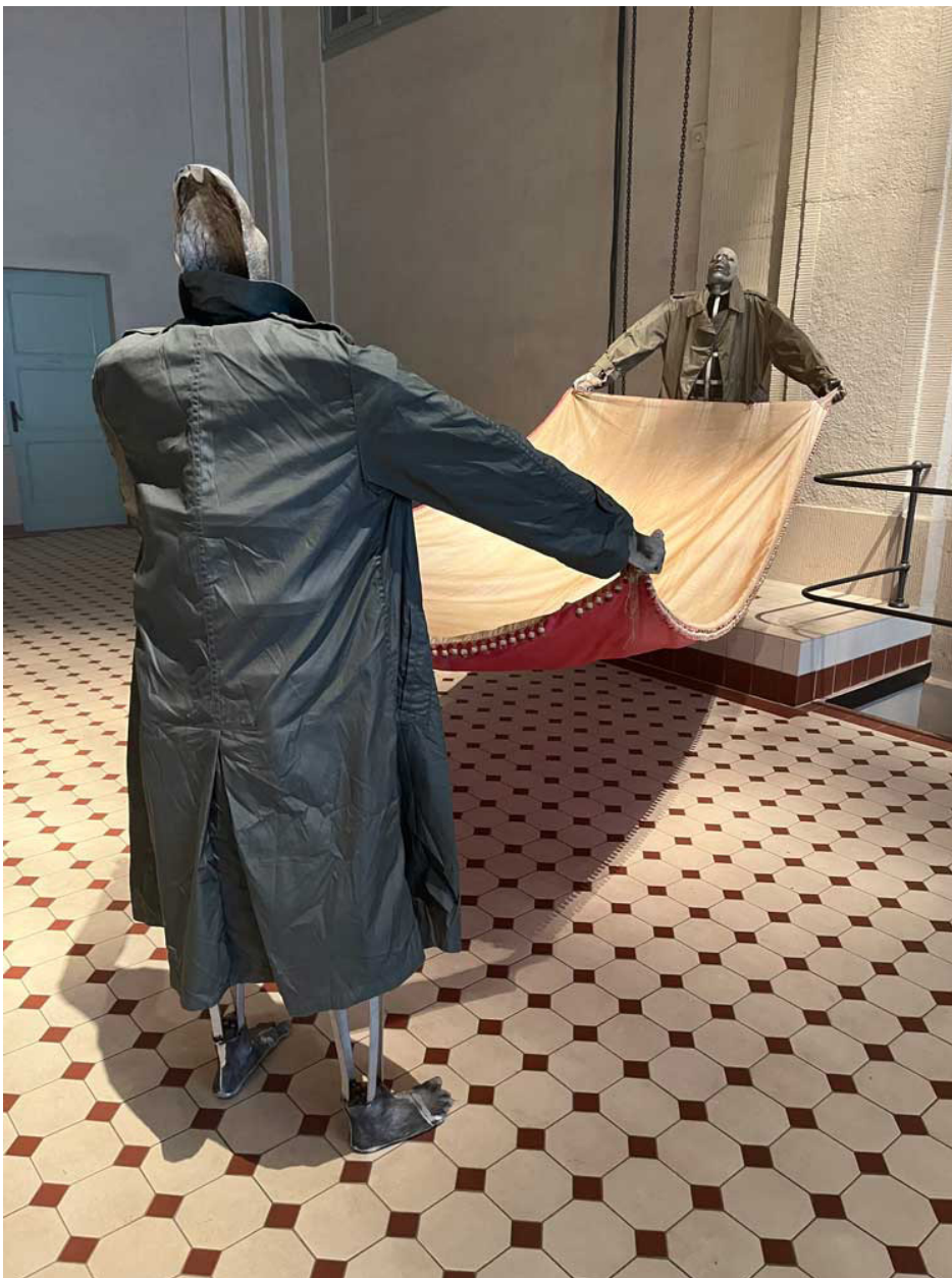
Kira Freije. Unspeak the chorus, 2023. Stainless steel, cast aluminium, silk, cotton, 174 x 410 x 129 cm.

KF: I'm quite tidy in my studio, quite health and safety conscious. So, it was really good for me to have that contrast. I have used metal ever since school. I've always been very drawn to it, and I can't give you any hugely symbolic reason why.