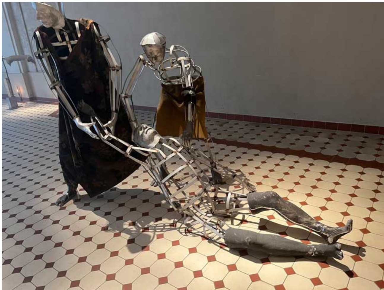
Kira Freije. Trudging, the sodden prelude, 2023. Stainless steel, cast aluminium, wool, suede, hide, 170 x 75 x 243 cm.

characters in antique robes instantly draw the eye from the doorway, in particular one whose beaten-metal headdress casts a halo above it, albeit one fringed with blunt spikes. Its title, Vocabulary of Ruin and the Divine Wound amplifies the sense of drama and is typical of Freije's poetically named pieces (all the works here were made in 2023). As you approach this pair from the rear, there is a suggestion of some liaison or conversation between church dignitaries, but turn a corner and it is clear that the character in the headdress is top dog, his companion subservient but also subversive - lighting a cigarette as he leans in (to drop some delicious piece of gossip into his companion's ear?). His inclined form draws your eye down towards the high heels and platform soles on the cardinal's feet. Nothing is quite as it seems in Freije's world. There is a strong sense of mystery, augmented by the light playing across the room, making the absence of flesh, the gaps in their bodies, as well as the imagined emotions and actions, even more intriguing.