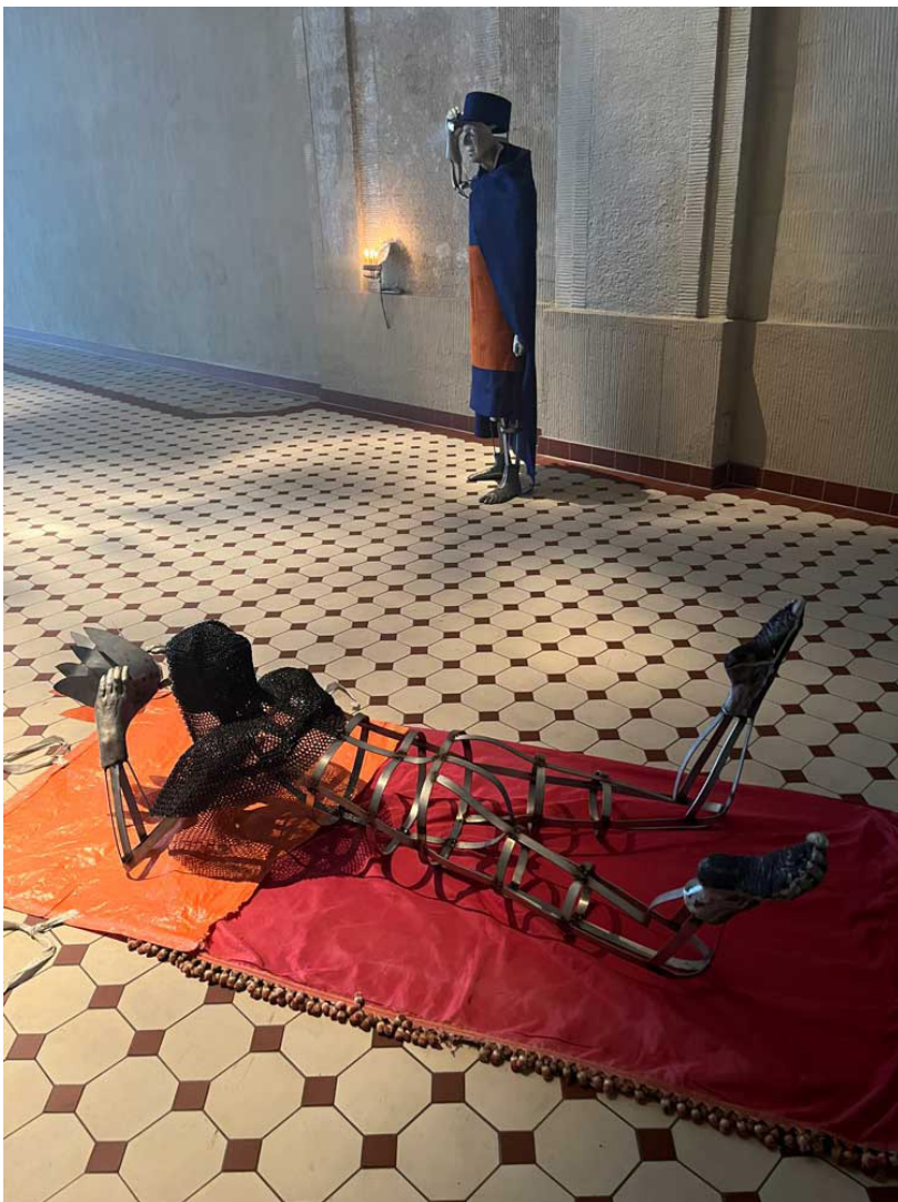
Kira Freije. Between Sunlight, 2023. Stainless steel, cast aluminium, silk, tarpaulin, 57 x 205 x 98 cm.

KF: I have done that in the past, but I allowed it to come much more to the fore in this group. And I've been thinking about the theatricality of it as well. There were years when I was averse to falling into that and now I want it. But there's a quality of being still in the world of sculpture and staying the right side of it, which is often the struggle with my work anyway because of the materiality of it. I never even really think of myself as a metal sculptor ... I just use metal because it's such a smart material to use. It's like better cardboard ... you can stick it really easily and really well. I have an affinity to it, of course, but there's a fine line I always have to tread: of staying somewhere strange and interesting to me and not falling towards the kind of technical sophistication of metalworking, which I'm not particularly interested in.