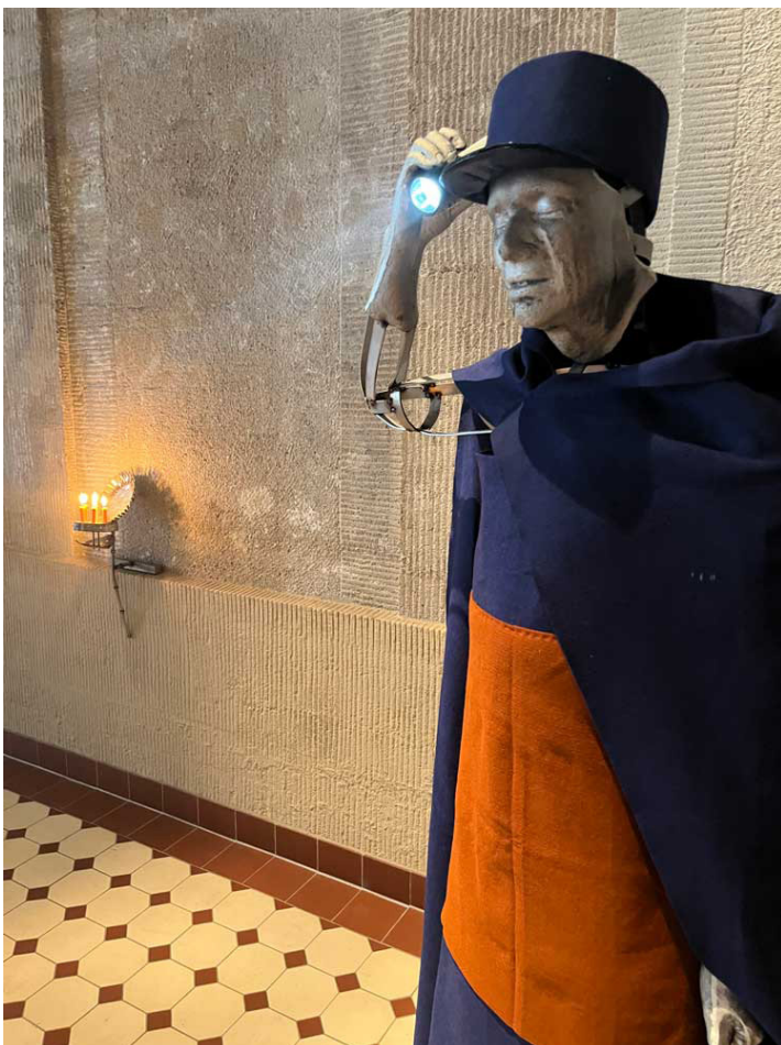
Kira Freije. Remorse the violent whisper, 2023. Stainless steel, cast aluminium, felt, leather, torch, 173 x 272 x 30 cm.

KF: We went through lots of briefs. I said I don't know anything about lighting, so I don't really know what to tell you except for the fact that this is kind of what I want. I described Grand Central Station, but also the foundry where I get all my aluminium cast, which has amazing light, but the windows are so caked with the sand and grime of years that you get an amazing orange dappling coming through. We were talking also about very slow washes of natural light – theatrical, but without the colour. And the impossibility is that I want it to still be daylight. It was very seductive when it was dark – originally the windows were blacked out - but it's stranger somehow and more like the original intention in this atmospheric world to have filtered daylight ... it's that kind of industrial atmosphere and a place of motion as well.