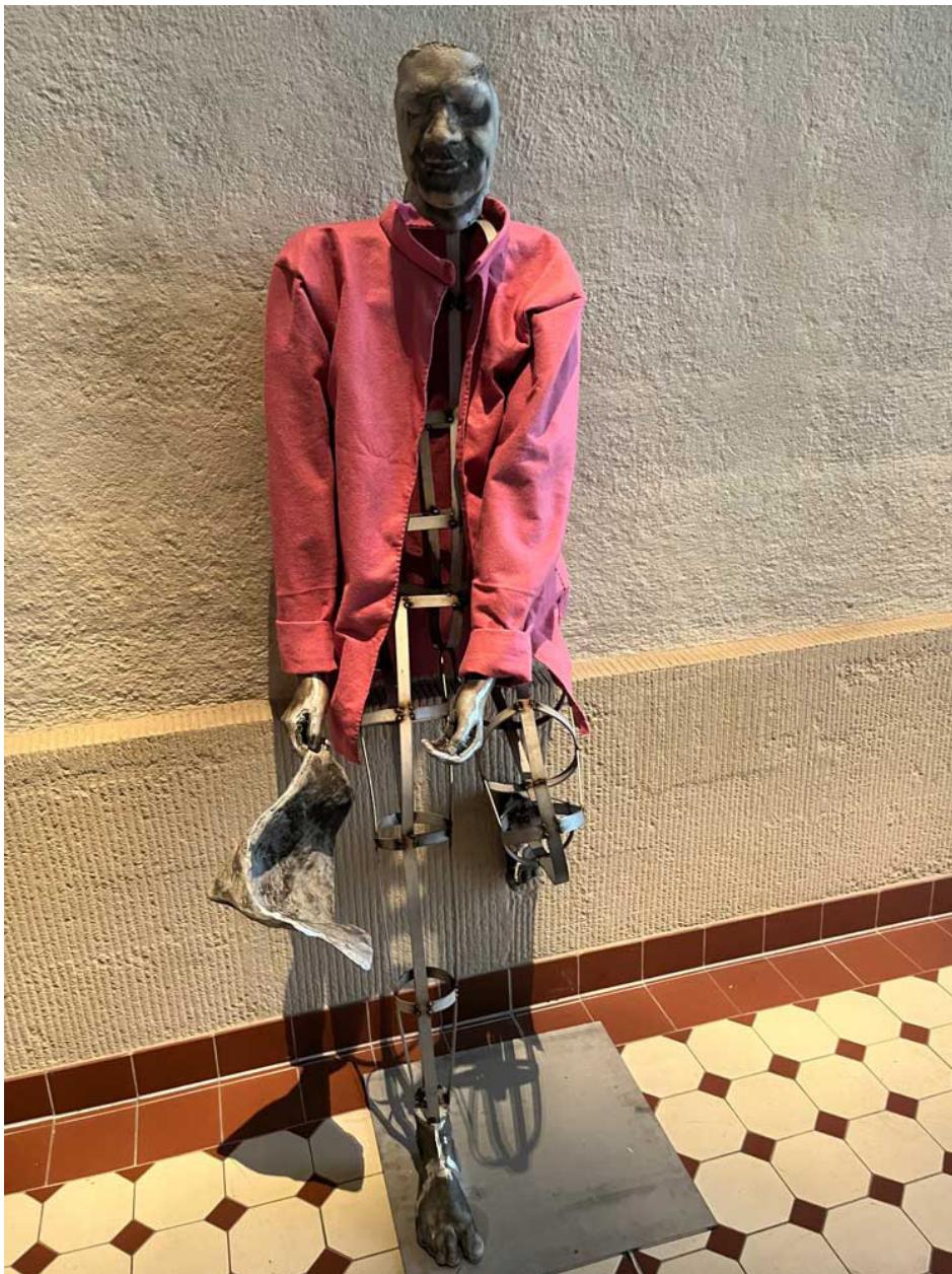
Kira Freije. Temperant observer, 2023. Stainless steel, cast aluminium, felt, 175 x 75 x 68 cm.

KF: I'm sure there was. I always start around [TS Eliot's] Four Quartets.