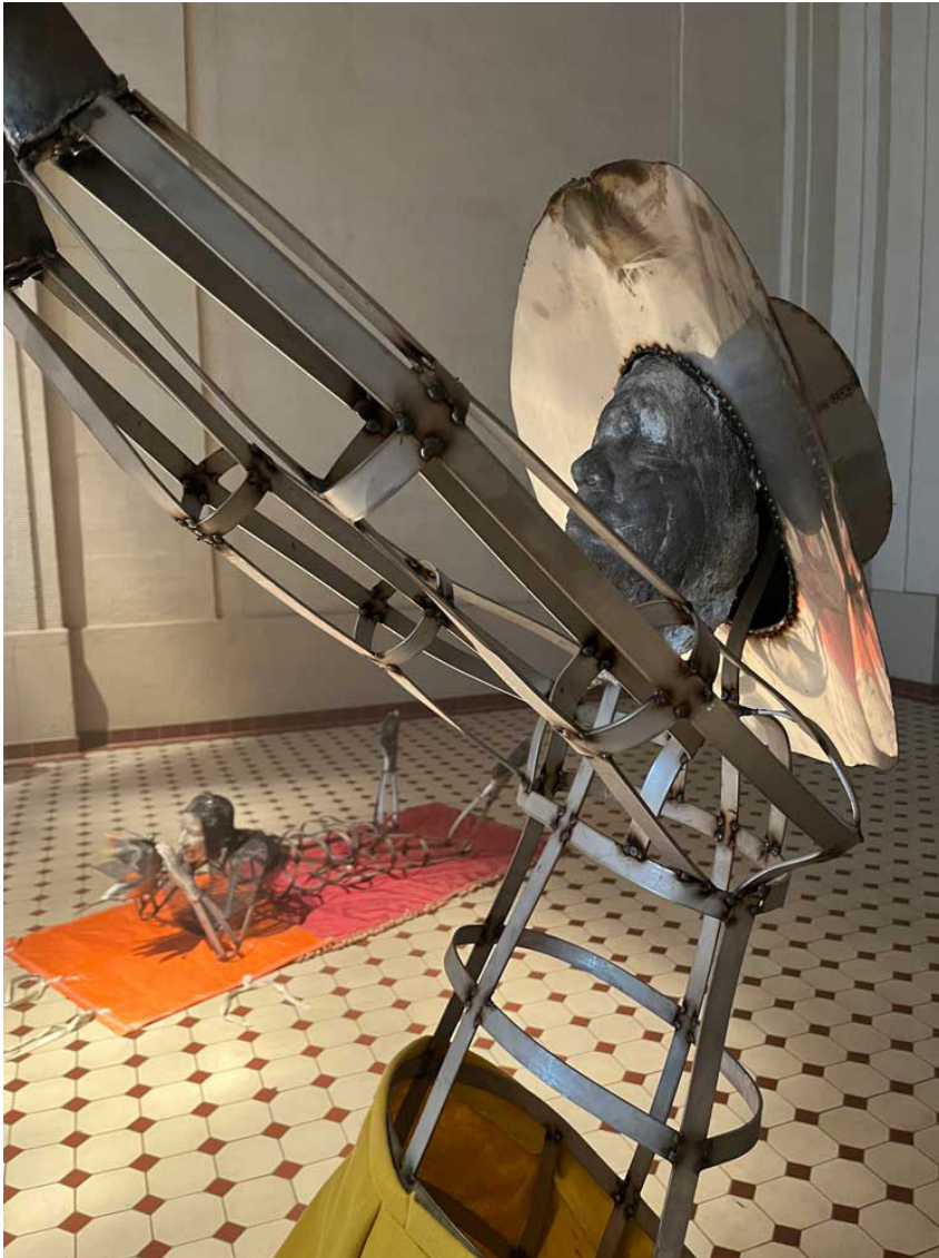
Kira Freije. Scorched Earth, 2023 (detail). Stainless steel, cast aluminum, felt, 183 x 52 x 88 cm.

KF: Yes, and that's the beauty of the materiality. And being put together in my studio, that process allows that to- and fro-ing to happen more and more. There is obviously a story within it, but I also enjoy it when the story can shift one way or another. For me, I'm probably quite impatient or I get bored easily. So, I like to be excited by it, and to not know; to be surprised.