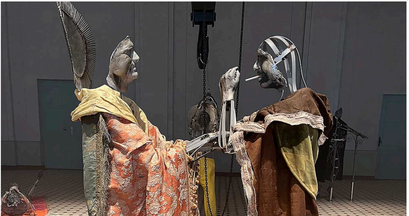
Kira Freije. Vocabulary of ruin and the divine wound, 2023 (detail). Stainless steel, cast aluminium, silk, velvet, wool, cigarette.

The E-Werk’s Turbine Hall is the perfect setting for Freije’s new figurative metal sculptures. This vast venue opened up new possibilities for her work, she says, explaining the ideas behind her figures and how using lighting designers has been transformational