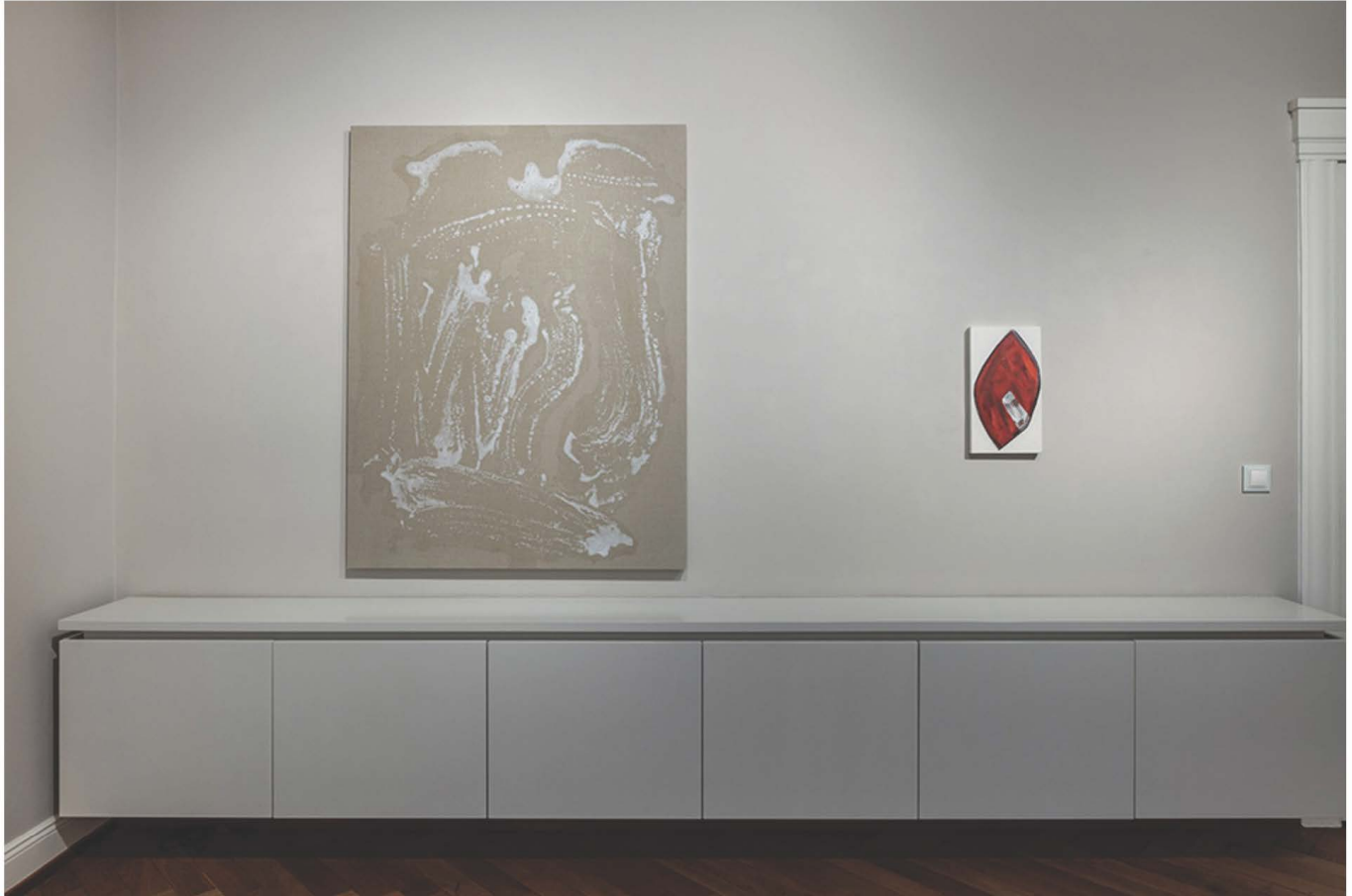
Installation View.

HAMBURG. - Things lying on the floor. Or on the table, perhaps. Objects or loose substances resting horizontally on the surface, entirely at the mercy of gravity. Or so it seems. But here, the thing is a picture. The flat ground is tilted by 90°, together with the subject, and hangs on the wall as a painting. This gesture, simple as well as literally ground-breaking, enables Helene Appel to bring the (illusionary) space of representation into her painting, into the classic panel painting – while at the same time revealing the illusion. In her veristic depiction of mostly everyday objects, the artist, who studied with Olav Christopher Jenssen at the HfbK Hamburg, has been pursuing a form of painterly realism for almost two decades now, simulating her subjects both blatantly and effectively. Withdrawing all perspective – the images are frontal, the horizon is erased from the painting – Appel gives the painted object a three-dimensional, strikingly tangible presence.