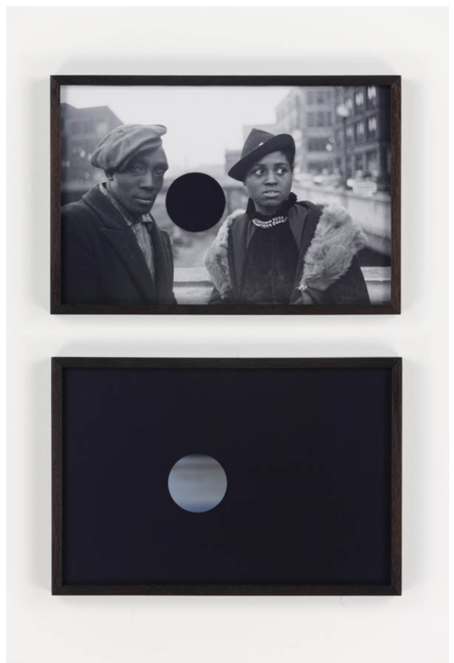
Lisa Oppenheim, Killed Negatives, After Walker Evans , 2015. digital c-prints 8 5/8 × 26 7/8 inches; 21.9 × 68.2

Oppenheim: I almost never take pictures . I have some cameras and I do Instagram; I can use a light meter and stuff like that, but that to me has never been the interesting part, it's more about how objects and images accumulate meaning over time. Even with the textile photographs, the fact that they got to me over eBay,