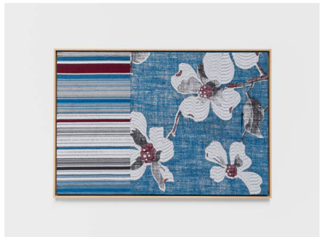
Lisa Oppenheim, Jacquard Weave (Apple Blossoms) , 2017. Jacquard woven cotton, mohair and linen textile in wood frame 32 × 47 inches; 81.3 × 119.4 cm (framed) 30 1/2 × 45 1/2 inches; 77.5 × 115.6 cm (unframed) Edition of 1; 1 AP. Courtesy the artist and Tanya Bonakdar Gallery, New York

Rail: Your work invites viewers down a similar path. I mean, when I was thinking about your series