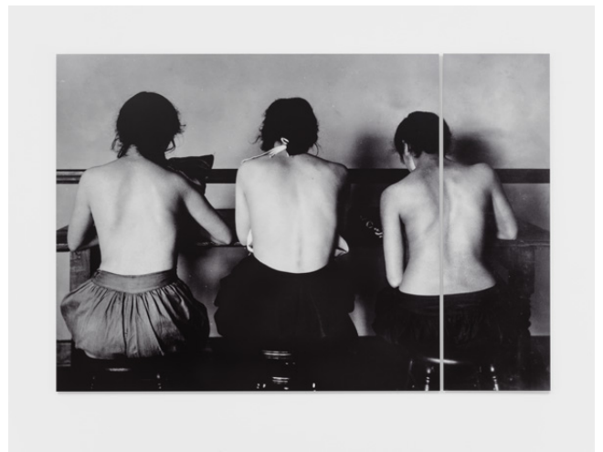
Lisa Oppenheim, Incorrect sitting position for postural deformity and dorsal curvature cases. Scoliosis. Work in this position is harmful. 2017. dye-sublimation print mounted to aluminum. 39 × 56 3/8 inches; 99.1 × 143.2 cm (overall) 39 × 44 inches; 99.1 × 111.8 cm (left panel) 39 × 12 3/8 inches; 99.1 × 31.4 cm (right panel)

Oppenheim: Yes. So thinking about these girls—thinking about what they would have been making—it led me to wonder whatever happened to the textiles they made. I've worked a lot with textiles in the past, and a lot of the historical textiles that were kept were the ones that are considered