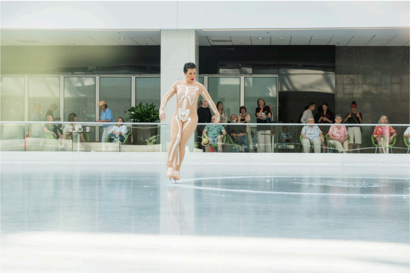
Amanda Ross-Ho, Untitled Figure (THE CENTER OF IT ALL) (performance view, Lloyd Center, Portland), 2023.

Jonathan Griffin Reviews 12 October 2023 ArtReview