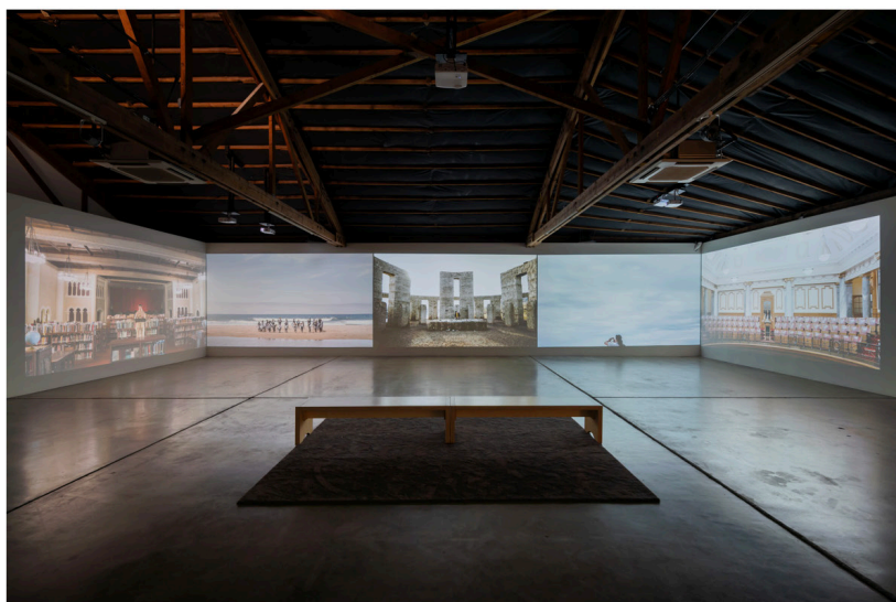
Sam Hamilton, Te Moana Meridian , 2020–2022, HD video, 8 min 42 sec.

It's a well-meaning gesture I feel deeply conflicted about. As with Viveros-Fauné's biennial at large, Broken Spectre points to the political heft of aesthetics, but also the futility – not to mention self-satisfied tokenism – of much individual action. Symbolic representation alone can seem disingenuous, like the painting in Assembly by Irish artist Brian Maguire of a soup kitchen, apparently done from a photograph. (How to provide for Portland's chronically unhoused seems as insurmountable as the global climate crisis.) By contrast, Mosse's QR code might be seen as heroic.