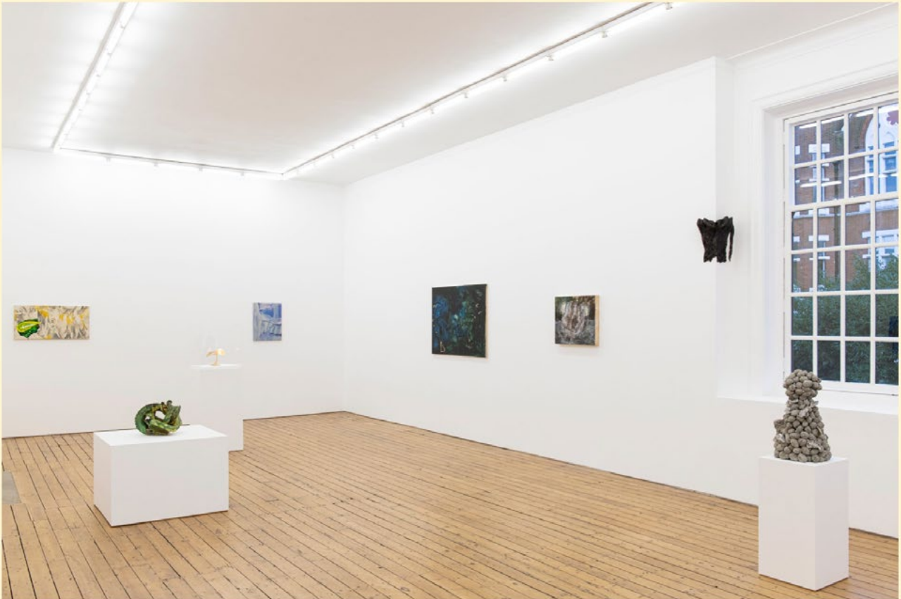
The sun rises under the pillar of your tongue, 2023, installation view

The sun rises under the pillar of your tongue runs at The Approach until 18th February 2023.