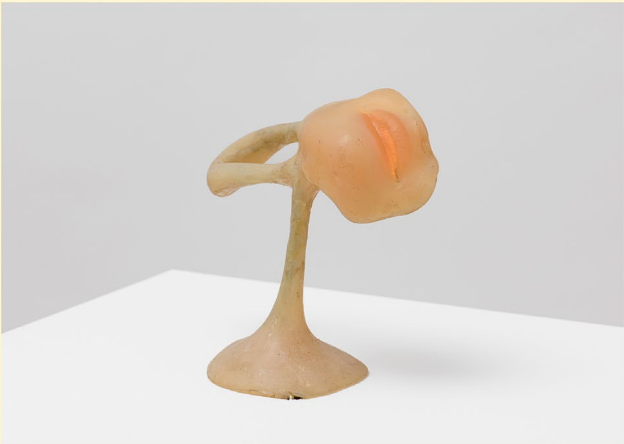
Alina Szapocznikow, Sculpture-lampe X ( Sculpture-Lamp X ), c. 1970, Coloured polyester resin, light bulb, electrical wiring and metal, 20 x 23 x 12 cm (7 7/8 x 9 1/16 x 4 3/4 in.)

The late Polish sculptor Szapocznikow is an interesting inclusion, if only because her lampe-bouche (illuminated lips), Sculpture-lampe X (1970) is more explicitly figurative than the rest of the works on display. Szapocznikow's renowned lamps are at first glimpse erotic – I used to say I'd love one in my (dream) mid-century LA living room – but they also belie stories of oppression, violence and the body as commodity. In a purely aesthetic sense, the lamp draws out the whispers of figurativism in the show's more abstract works.