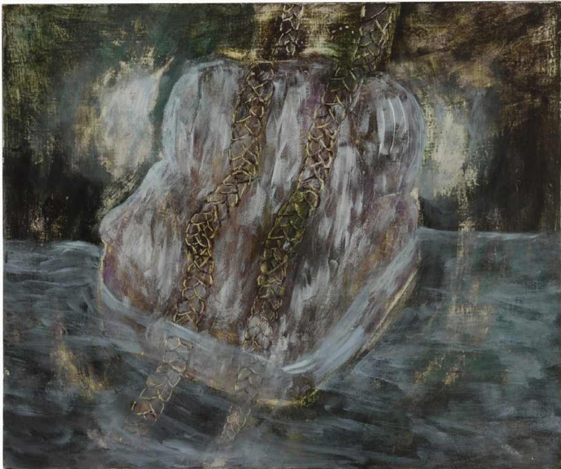
Rinella Alfonso, Two corn in a row , 2022, Egg tempera on wood, 50 x 60 cm (19 11/16 x 23 5/8 in.)

It seems most obvious to begin my text by writing about van Lankveld, but actually, I think that it is Cucchi's work which most clearly captures that unsettling moment at which art is at its best. Cucchi is known for his leadership of the Italian variant of Neo-Expressionism, Transavanguardia, which formed a reaction to minimalism and conceptualism, and reintroduced the figurative into painting and sculpture. BUCO DI CULO (2017) is a bronze rendition of a Rorschach inkblot test; revealing both of inner psyche and an organic, architectural quality in its three-dimensional form. Tar-like and formed of drips and streams, it is quite literally suggestive of crap, which would make sense since its title, according to Google Translate, roughly translates from Italian as 'asshole'.