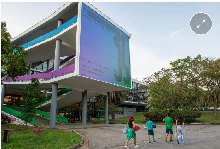
The Cicillo Matarazzo Pavilion, by Oscar Niemeyer, where the São Paulo Biennial is taking place.