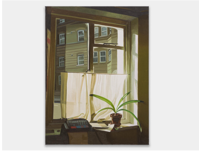
Mike Silva, Window , 2023, oil on linen, 81.3 x 61 cm. Courtesy: the artist and The Approach, London

Silva charges his works with the subtle melancholy of moments already lost. The solitary, outmoded fax machine in Window , for instance, reveals the age of the source photograph. The artist's generous and masterful use of white imbues each scene with a haziness that engenders the instability of memory. At the same time, curtains drawn partially – or entirely – over windows, are equally suggestive of movement and transience. In Curtain and Owen's Room , they operate as paradoxical mechanisms of concealment and revelation, alerting us to the possibility that something else is yet to be uncovered.