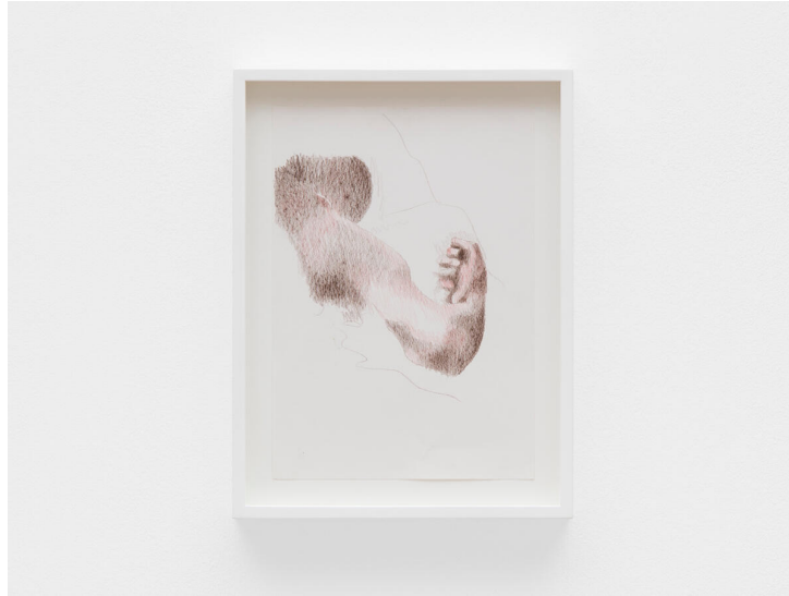
Mike Silva, Drawing of Gary , 2023, Polychromos pencil on paper, 29.7 x 21 cm. Courtesy: the artist and The Approach, London

The show also contains three figurative studies, including Drawing of Gary . The timeless interplay between light and dark is at the heart of Silva's meditative practice, which fuses classical approaches to still life and portraiture painting with personal narratives via an archive of source photographs taken over the last three decades. The resulting works emerge as snapshots from the artist's memory: domestic interiors and flashes of former lovers. These almost-filmic glimpses tell only fragments of stories.