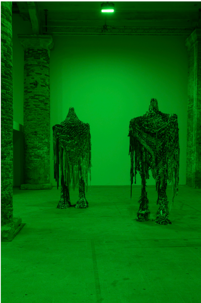
Sentinels of Change, 2021 59th International Art Exhibition – La Biennale di Venezia, The Milk of Dreams