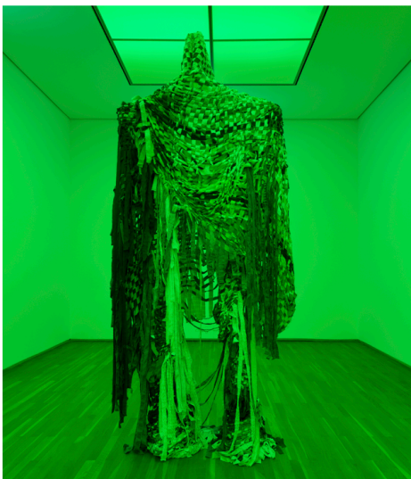
Beyond the Black Atlantic, installation view, Kunstverein Hannover, 2020