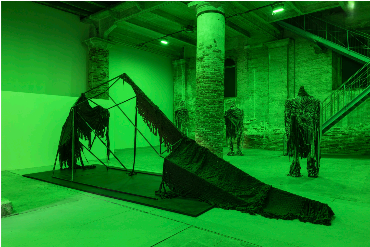
Sentinels of Change, 2021 59th International Art Exhibition – La Biennale di Venezia, The Milk of Dreams