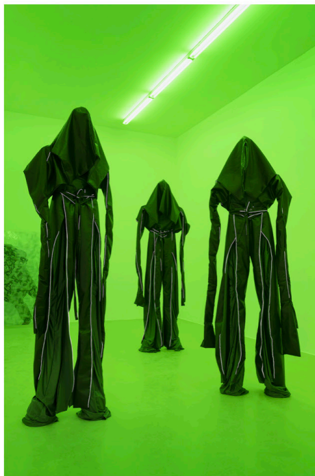
Beyond the Black Atlantic, installation view, Kunstverein Hannover, 2020

Elusive figures, possibly black subjects that cannot be captured or controlled in the public space, are also a persistent presence in Sandra Mujinga's body of work. For her recent installation Closed World, Open Space at the Munch Museum (2022), she produced three video-sculptures depicting the figure of an animated Black person with dreadlocks running through the three boxes. One can't really see the face, neither the hair that is covered up until the character finally appears with their face that has multiplied into five faces, before starting running again. Similarly, her video installation Pervasive Light (2021) depicts an ungraspable cloaked Black figure whose image is blurred as they walk in and out of the screens and the light. With new technologies of faced recognition and after several months spent wearing surgical masks in public spaces, our faces don't really belong to us anymore. Mujinga suggests a futuristic set-up where we could share and merge our faces in real time.