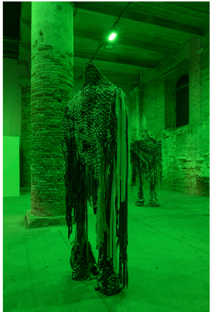
Sentinels of Change, 2021 59th International Art Exhibition – La Biennale di Venezia, The Milk of Dreams