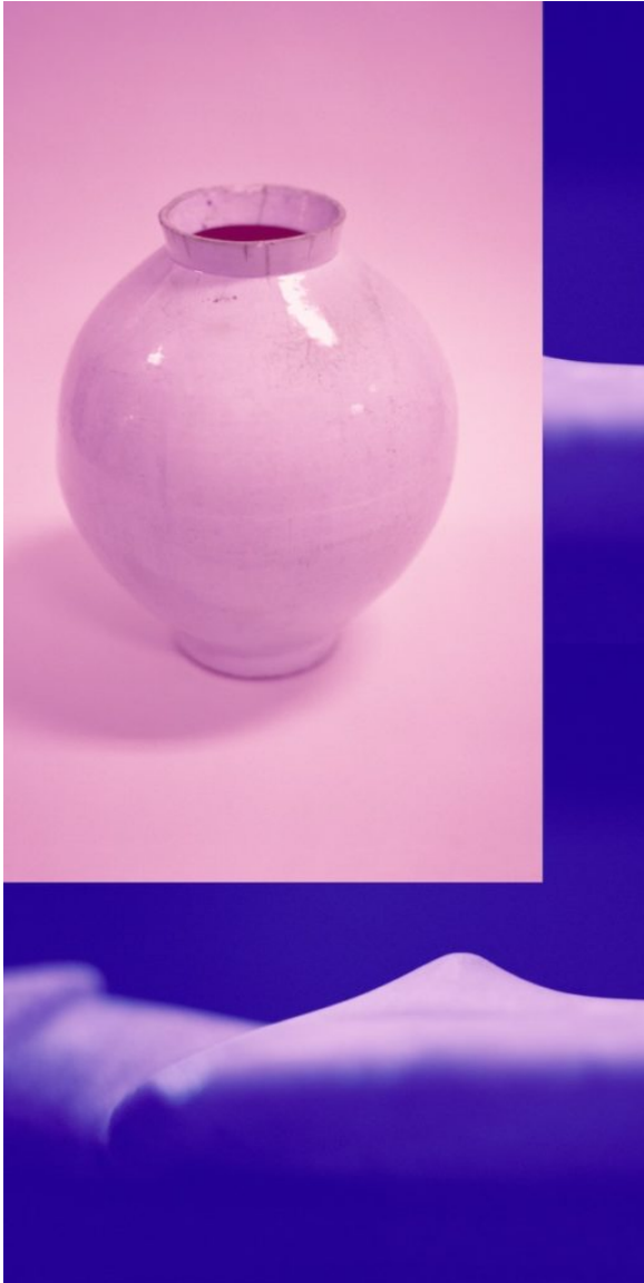
Women & Museums II. 2019. © Sara VanDerBeek