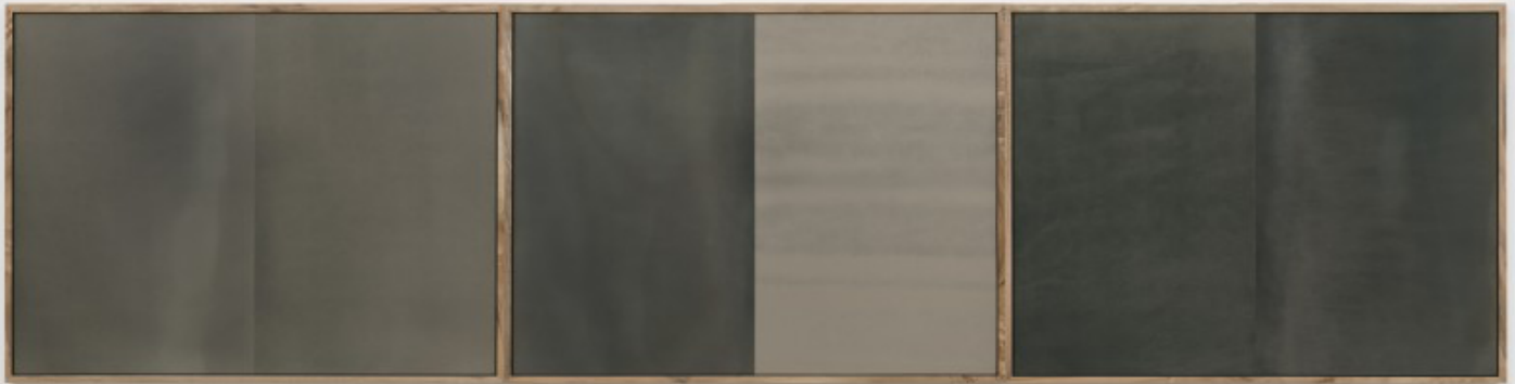
Lisa Oppenheim, "4:3:2 (Version III)," 2020. Tiled silver gelatin photograms. 30-3/8 inches by 120-3/8 inches by 1-1/2 inches

Oppenheim juxtaposes two such photograms per frame and then hangs the framed pairs singly or as sets of two or three. The different dimensions of the works refer to the aspect ratios of still photographs and silent motion picture film.