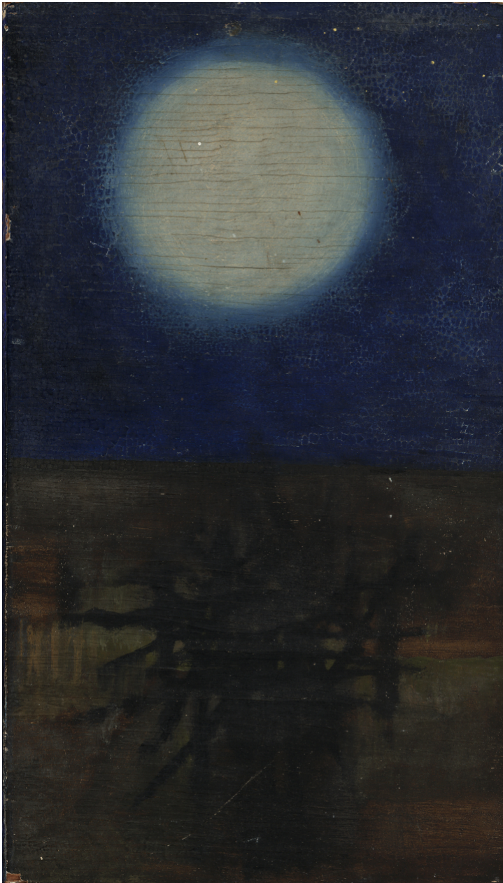
Stan VanDerBeek, "Untitled (Lune Light)" (ca. 1955), paint on wood panel, 10 3/8 x 5 7/8 inches (image); 12 3/8 x 7 7/8 inches (frame)

The exhibition also highlights instances of poetic alignment between the two artists. One gallery wall is lined with nine figure studies by Sara VanDerBeek, layered C-prints in seductive neon colors, their titles invoking the rising moon and the setting sun. Nearby on the floor a white cylinder lies on a bed of cloth: her "Moon" (2015). Overlooking them is a small painting made by Stan VanDerBeek ca. 1955, "Untitled (Lune Light)": a full moon in a deep blue sky over a simple landscape. Here, as throughout this show, bodies in space — sculptural, filmed, photographed, painted; dancing, abstracted, celestial — are fundamental to the artists' bodies of work.