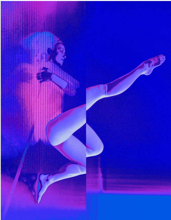
Sara VanDerBeek, "Baltimore Dancers Twelve" (2019), digital C-print, 20 x 15 3/4 inches. Edition 1 of 3

This exhibition of works by Stan and Sara VanDerBeek shows how both artists span traditional boundaries between media and engage similarly intangible concepts: spirituality, the mutability of time, memory, and space.