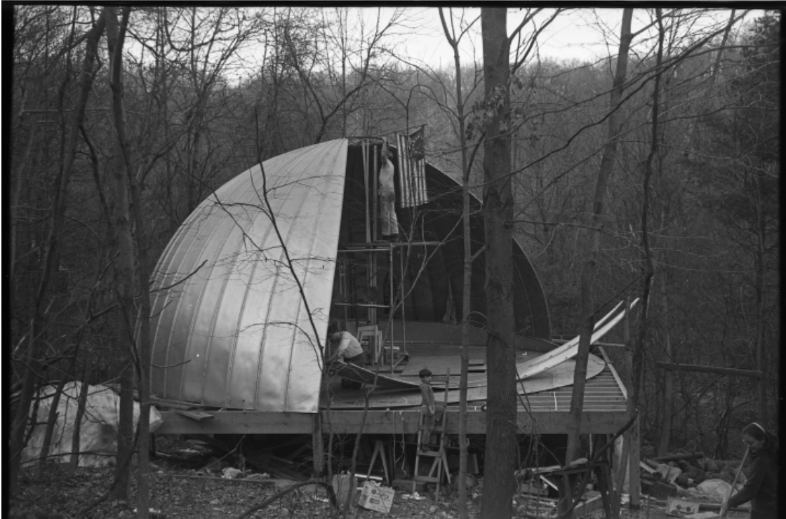
Stan VanDerBeek's Movie-Drome (1963–65) under construction in Stony Point, New York