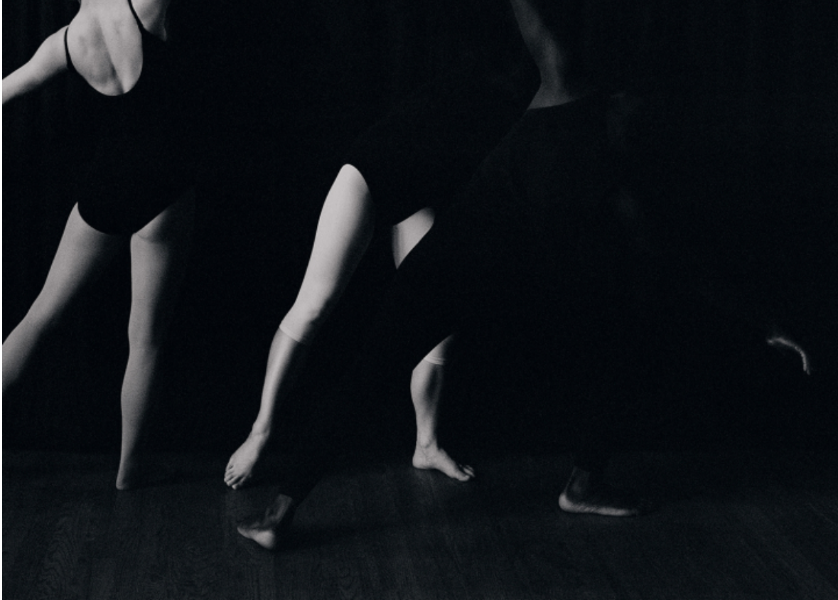
Sara VanDerBeek, “Roman Stripe IV” (2016), diptych; 2 digital layered C-prints, each: 96 7/8 x 48 7/8 inches (framed), overall: 96 7/8 x 100 3/4 inches. Edition 1 of 3, 2 APs

VanDerBeek began his experimental film work in the 1950s, not long after leaving Black Mountain. His films and videos often incorporate wildly eclectic imagery — combining found footage, animation, still imagery, and riotous soundtracks — all moving at an exhilaratingly frenetic pace; a paradigmatic example is his 1963 tour de force Breathdeath , on view in this show. VanDerBeek observed that he was simply following the rhythm of his times. In the 1968 documentary film VanDerBeekiana: Stan VanDerBeek’s Vision , he declared: “Culture is moving into what I call a ‘visual velocity.’ Sometimes I wake up and think to myself: It looks like it’s going to be a 60-mph day.” In an effort to cram as much experience as possible into the dizzying moment, in the mid-1960s he invented his Movie-Drome, a vast, dome-shaped audiovisual laboratory built in Stony Point, New York, in which multiple film projections could be experienced simultaneously. Investigating the intersections of art, technology, and communication, he understood the power of television and foresaw the then-nascent potential of computers, fostered by stints as artist-in-residence at Bell Labs, MIT, and NASA.