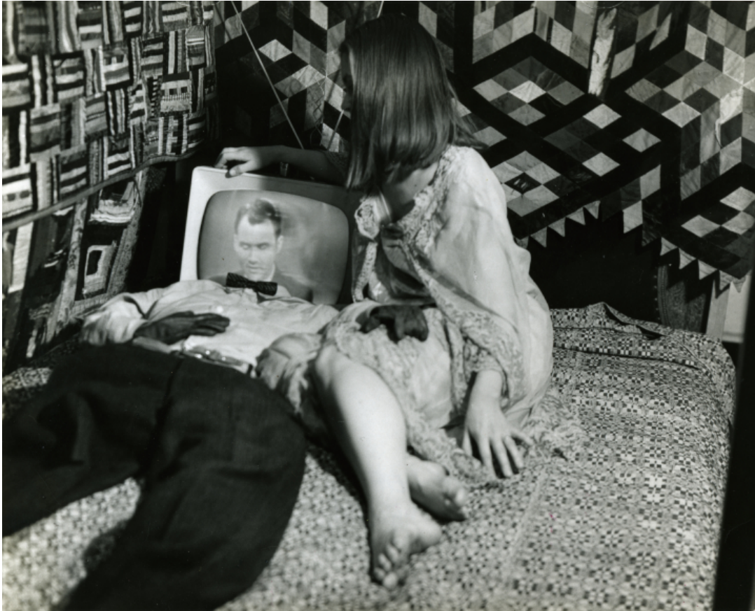
Stan VanDerBeek, still from Breathdeath (1963), 35mm film transferred to video, black and white, sound, 14.33 min.