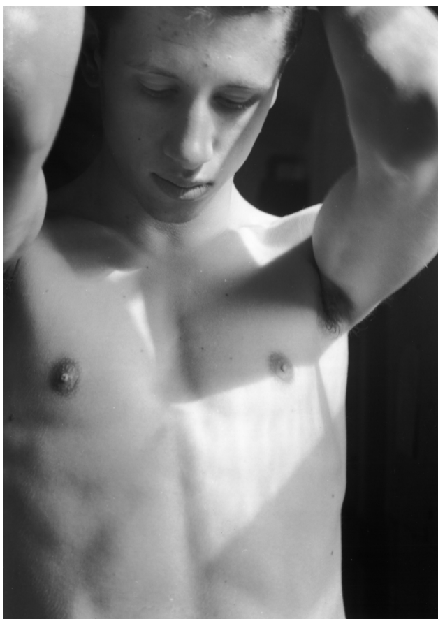
Stan VanDerBeek, “Untitled” (1950, printed 2008), silver gelatin print, 8 x 10 inches Sara VanDerBeek, “Baltimore Dancers Six” (2012), digital C-print, 6 x 8 inches (image); 16 1/4 x 16 1/2 inches (frame). Edition 3 of 3

managed, strikingly, to establish her own firm voice as a creator. Her multivalent work — combining photography, sculpture, and installation — has been featured in solo exhibitions at the Whitney Museum of American Art (2010), the Hammer Museum (2011), and the Museum Boijmans van Beuningen (2015), among other institutions. Yet her output, including these successes in her own right, has inevitably been touched by her father’s creative legacy.