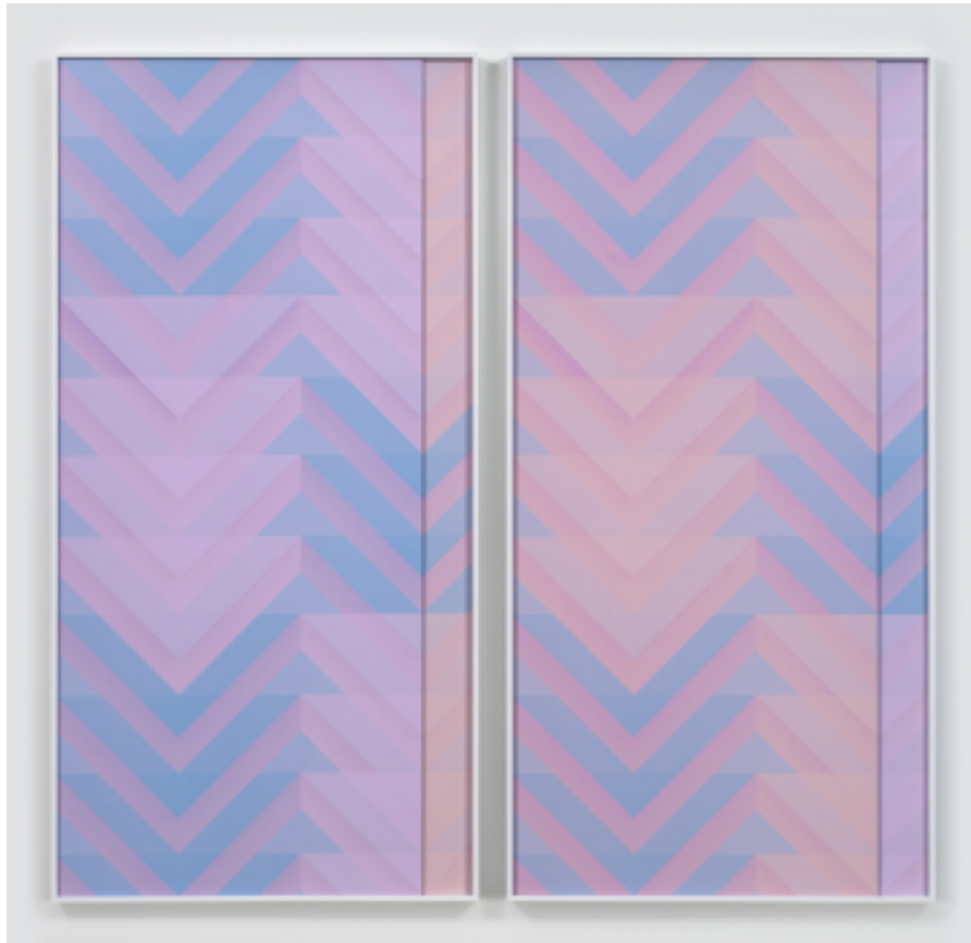
Sara VanDerBeek, "Roman Stripe IV" (2016), diptych; 2 digital layered C-prints, each: 96 7/8 x 48 7/8 inches (framed), overall: 96 7/8 x 100 3/4 inches. Edition 1 of 3, 2 APs

Among his films featured in this show are two untitled 1965 collaborations with dancers; these were eventually used as projections accompanying Variations V , a multimedia performance project by Cage, Cunningham, and David Tudor. In one — with the privileged access that only film or physical intimacy can offer — we see up close Cunningham's gloriously gnarled feet and watch him move like an animal, graceful and frantic, across his rehearsal room.