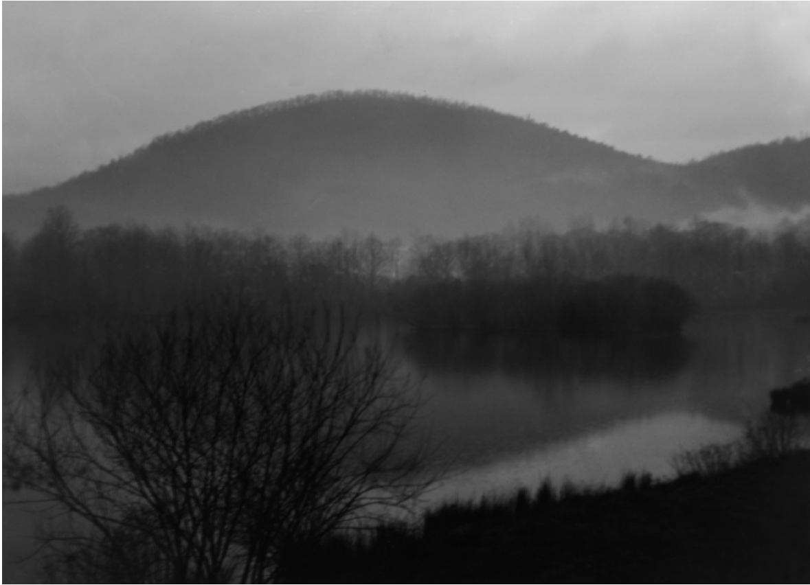
Stan VanDerBeek, “Untitled” (1950, printed 2008), silver gelatin print, 8 x 10 inches

VanDerBeek + VanDerBeek continues at the Black Mountain College Museum + Arts Center (120 College Street, Asheville, North Carolina) through January 4, 2020. The BMCM+AC’s 2019 “ReViewing” conference took place at University of North Carolina Asheville’s Reuter Center, September 20–22; the focus of the symposium was Stan VanDerBeek, and the keynote speakers were Sara VanDerBeek and Chelsea Spengemann.