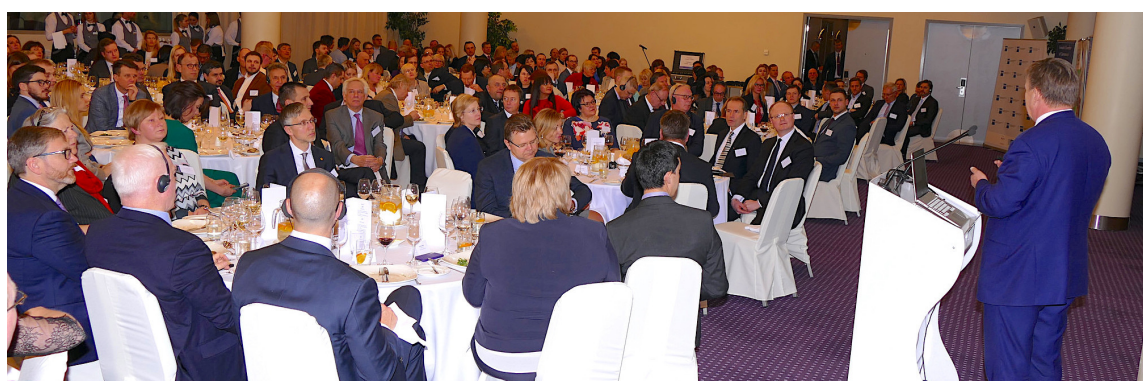
Joint Chamber Dinner with Latvia's Prime Minister Māris Kučinskis, February 21, 2018