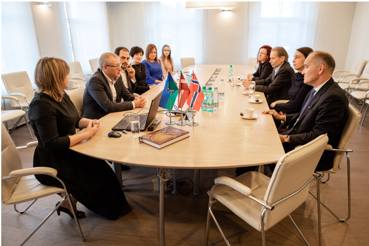
January 18, 2019