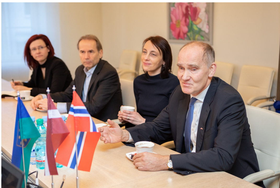
January 18, 2019

"From the Norwegian Embassy in Riga we appreciate very much the close and fruitful cooperation with NCCL. NCCL plays an important role in organizing Norway-related companies in Latvia and supporting our joint efforts in enhancing economic relations between Norway and Latvia. When we look at the extension and variety of the presence of Norwegian companies in Latvia, we are highly impressed and as ambassador I am very proud of it.