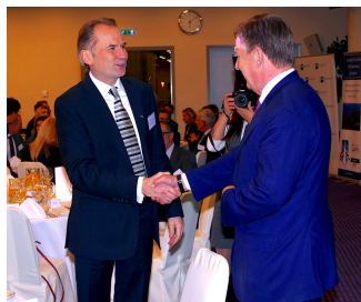
Joint Chamber Dinner with Latvia's Prime Minister Māris Kučinskis, February 21, 2018

Engaging in an active dialogue with Latvian state authorities either directly or through the Foreign Investors Council in Latvia, in which NCCL is an associate member, is one of the ways to promote sustainability, transparency and improvements in Latvia's investment climate.