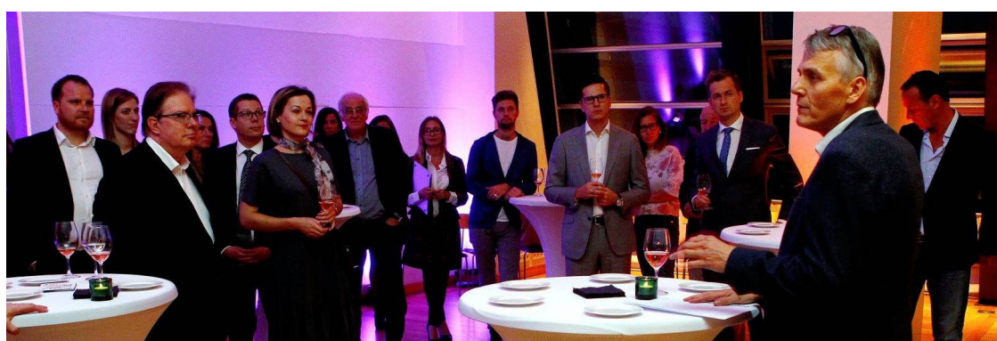
Vicentino Wine tasting at Hotel Bergs, October 18, 2018