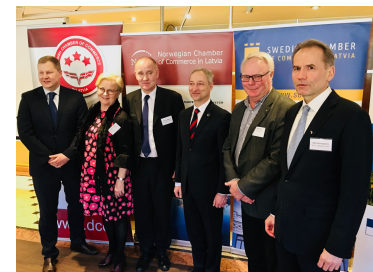
Joint Chamber Business Luncheon with Latvia's Minister of Justice Jānis Bordāns, March 6, 2019