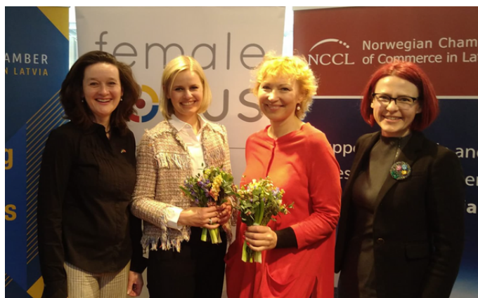
The Female Focus networking series was started in 2014 by the NCCL and the Swedish Chamber of Commerce in Latvia (SCCL). Female Focus is inspired by Scandinavian values and introduces speakers with different professional backgrounds inspiring both head & heart sharing their experience on relevant topics such as leadership, entrepreneurship, meeting professional and private challenges, and work & life balance.