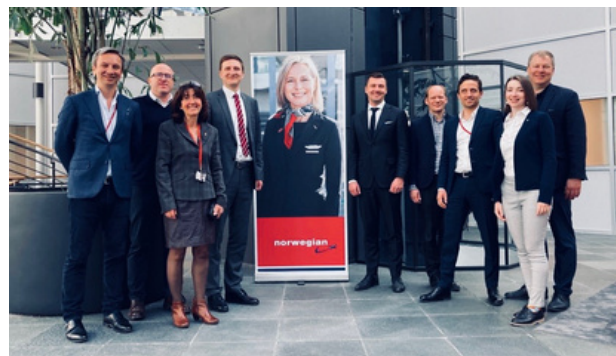
In pictures from top clockwise: Visit to the Confederation of Norwegian Enterprise (NHO) headquarters in Oslo; meeting with CODEX Advokat team; visit to the Norwegian Air headquarters in Fornebu; Reception at the Latvian Embassy in Oslo.