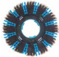
Natural Hair Brush For rubber floors, cork floors and timber sports halls.