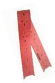
Linatex Squeegee Rubbers High quality standard squeegee rubbers. Durable and Chemical resistant.