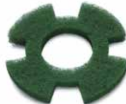
Green Pad Aggressive scrubbing pad, unsealed floors