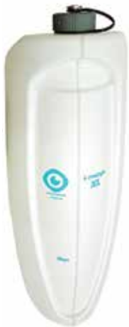
i-mop Recovery Tank This is where dirty water goes while cleaning. Suits i-mop XL & XXL.