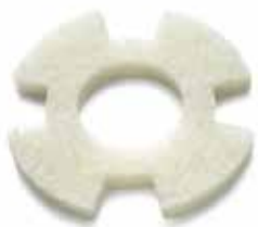
White Pad Light buffing & Polishing

Most Aggressive Maintenance/Deep Cleaning