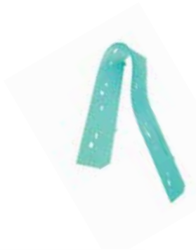
Primothane Oil Resistant Squeegee Rubbers Ultimate high performance squeegee rubber. Highly durable. Oil & chemical resistant.