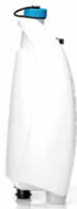
i-mop Clean Tank This is where clean water and chemicals are mixed. Suits i-mop XL & XXL.