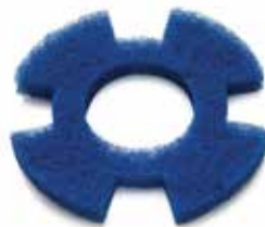
Blue Pad Heavy cleaning pad, dull or unsealed floors