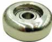
Stainless Steel Castors Heavy duty wheels designed for longer life on very rough floors. Suits i-mop XL & XXL.