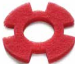
Red Pad Regular buffing and cleaning pad