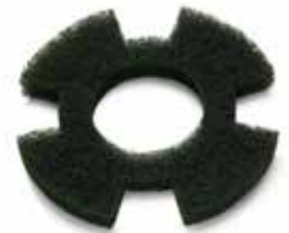
Black Pad Very aggressive scrubbing and stripping