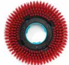
Heavy Red Brush Great for use with deep cleaning including grout lines.