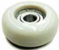
Castor Wheels Regular castor wheels for smooth floors. Suits i-mop XL & XXL.