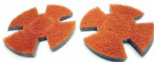
Orange Twister pad Non-homogenous ceramic tiles and renovation of Terrazzo, stone and concrete floors