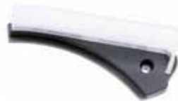
Splash Guard Splash guards assembly for i-mop XL & XXL. Sold as a set of 2.