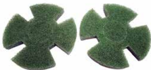
Green Twister pad Daily cleaning on stone, concrete, ceramic, vinyl, timber, rubber floors

Applicable for i-mop XL & i-mop XXL machines, not available for i-mop lite.