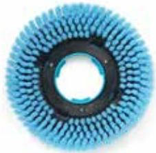
Light blue Brush Meant for light duty cleaning. Use on timber and delicate floors.

A variety of brushes are available for your i-mop, including soft, medium and hard bristles. A full range of pads handle a wide variety of soil types, floor types and cleaning applications. Use this guide to determine the most appropriate brushes and pads for your cleaning needs.