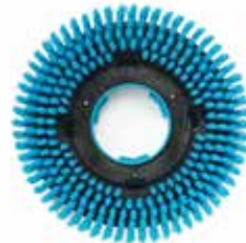
Medium blue Brush Designed for everyday scrubbing and cleaning. Equivalent to a red pad in terms of aggression. The standard brush supplied with i-mop.