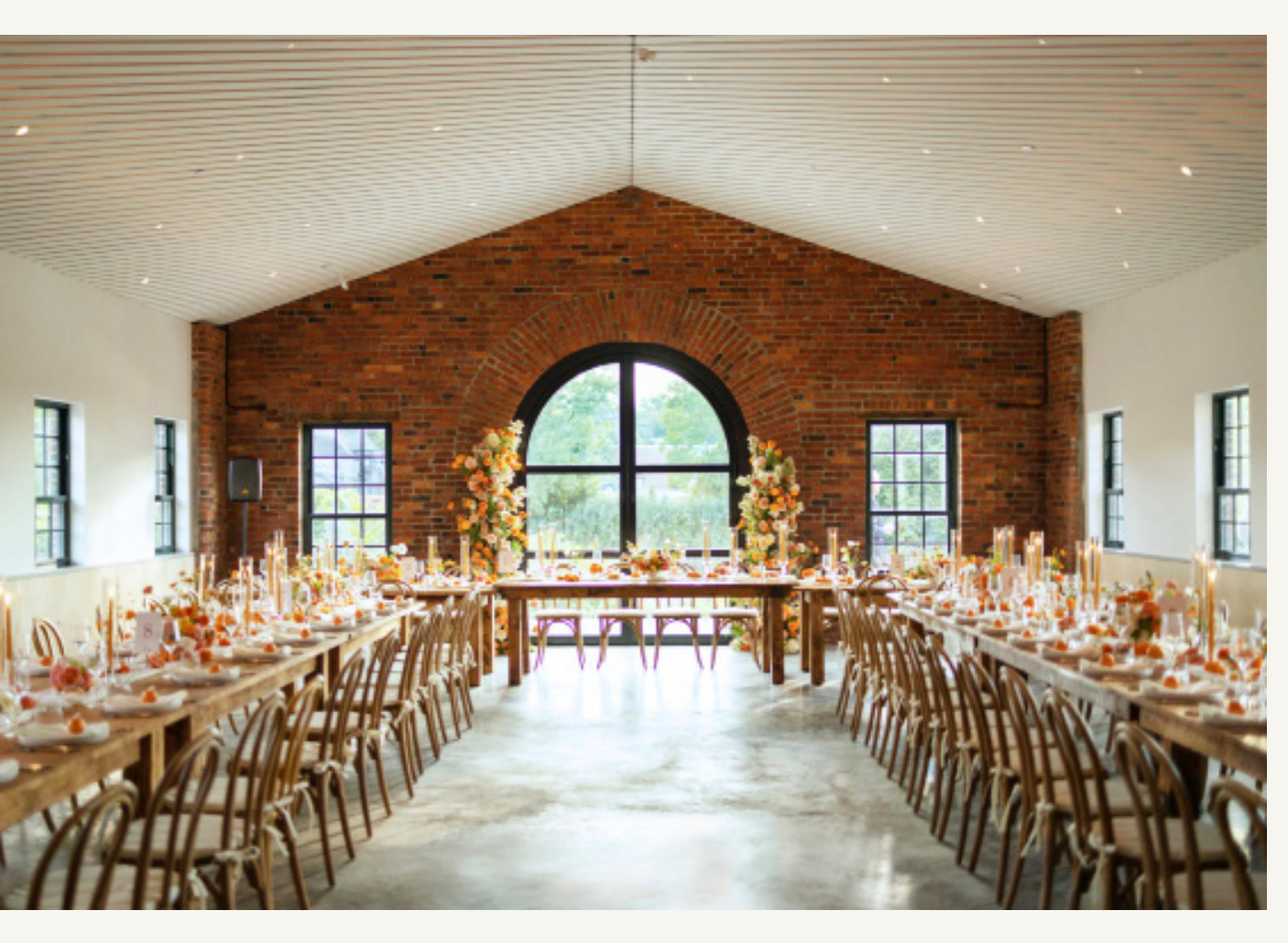
EVENT SPACE, BOOKHOUSE.