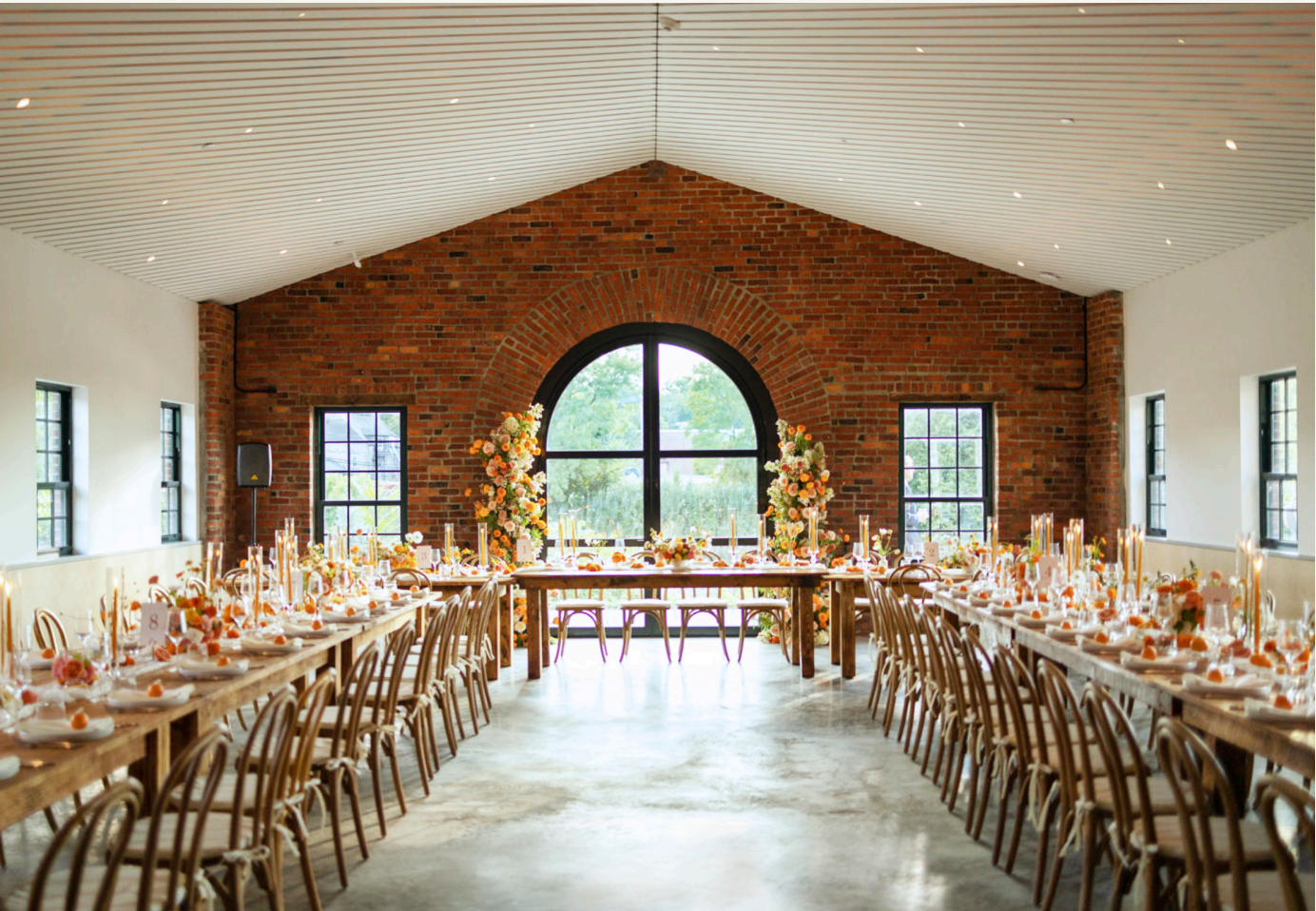
EVENT SPACE, BOOKHOUSE.