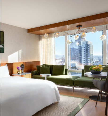
Fairmont Pacific Rim Hotel