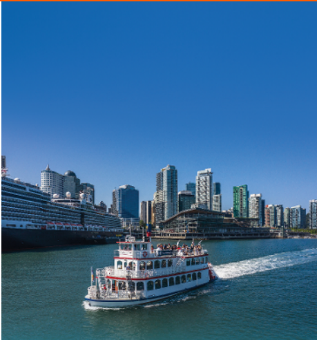
Harbour Cruises & Events