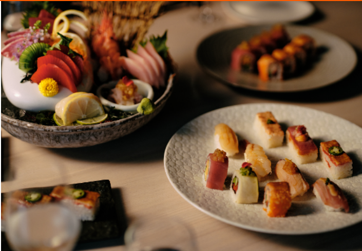
Diverse Culinary Scene