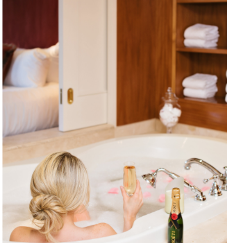
Wedgewood Hotel & Spa