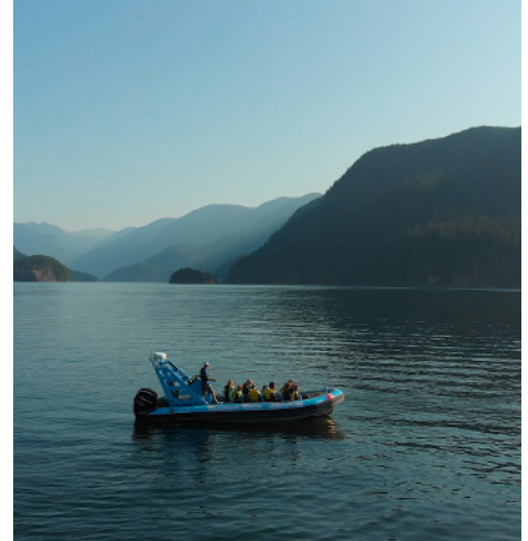
Vancouver Water Adventures