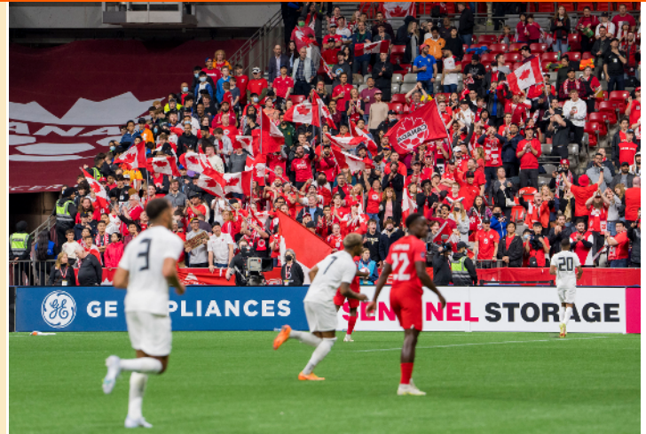
FIFA World Cup