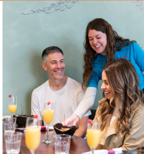
Taste Vancouver Food Tours