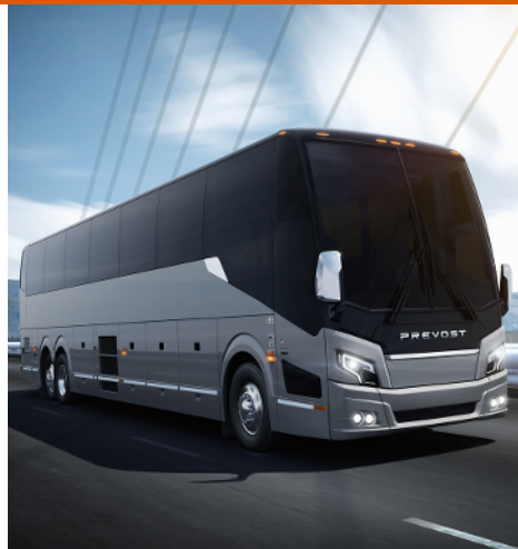
Star Limousine Service Ltd.