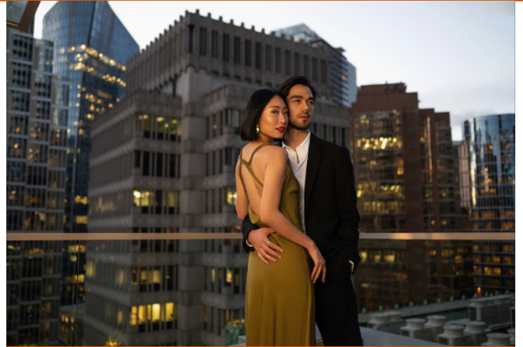
Lavantine Restaurant & Skybar