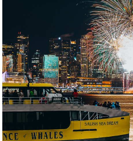
Prince of Whales Adventures