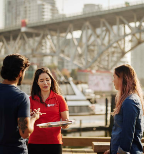
Vancouver Foodie Tours