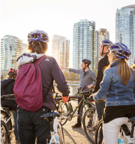
Cycle City Tours