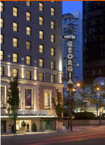
Rosewood Hotel Georgia