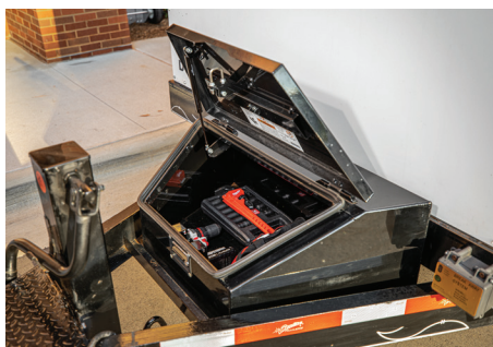
Convenient toolbox for frequently used items