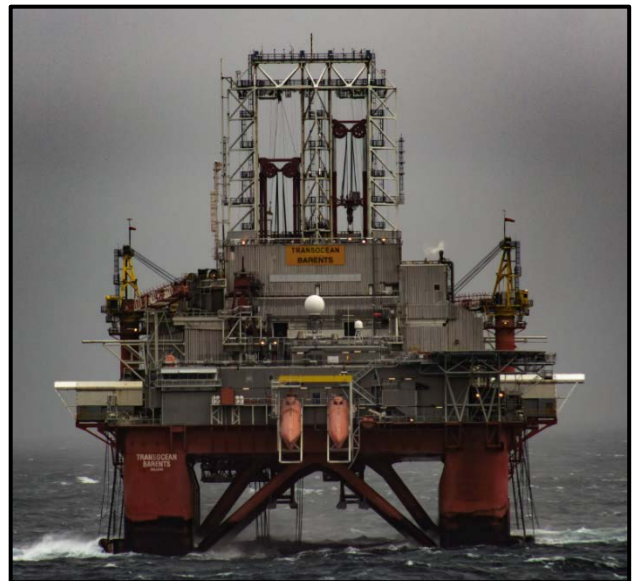
Figure 1: Transocean Barents MODU

Primary well control is maintained by drilling fluids ('mud') with sufficient density ('weight') to prevent the influx of formation fluid into the wellbore. Throughout the drilling industry, the loss of primary well control most frequently results from errors in fluid volume monitoring, swabbing, insufficient fluid density, or lost circulation. The objective for the 2020 drilling program is to maintain primary well control at all times by applying the preventative well control measures in the Transocean's Well Control Handbook, Equinor's Well Integrity and Well Control Manuals, and the TBR-Equinor Canada Well Control Bridging Document agreed between the Companies. Preventative well control measures include but are not limited to: