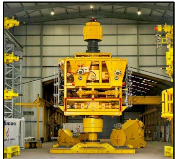
Figure 4: Capping stack

If the primary BOP closure is unsuccessful, there are several back-up BOP functions including ROV closure, acoustic signal, and deadman autoshear which may shut-in and seal the well. To prepare for the unlikely event of loss of well control, the Source Control Branch (SCB) and Incident Management Team (IMT) have plans and resources in place to mobilize vessels and equipment for site survey, subsea debris clearance, BOP intervention, subsea dispersant application, and capping stack installation. The capping stack can be connected on top of the BOP (at BOP/LMRP interface) or on top of the wellhead. Following the capping operation, a relief well may be required to intercept the existing wellbore and permanently seal the well. Relief drilling rigs and relief well equipment have also been identified for this purpose.