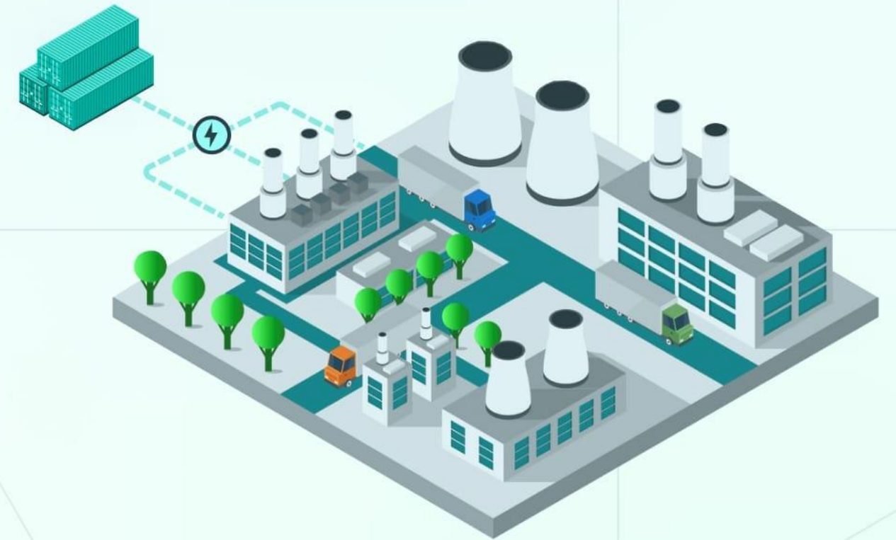
Waste to Energy