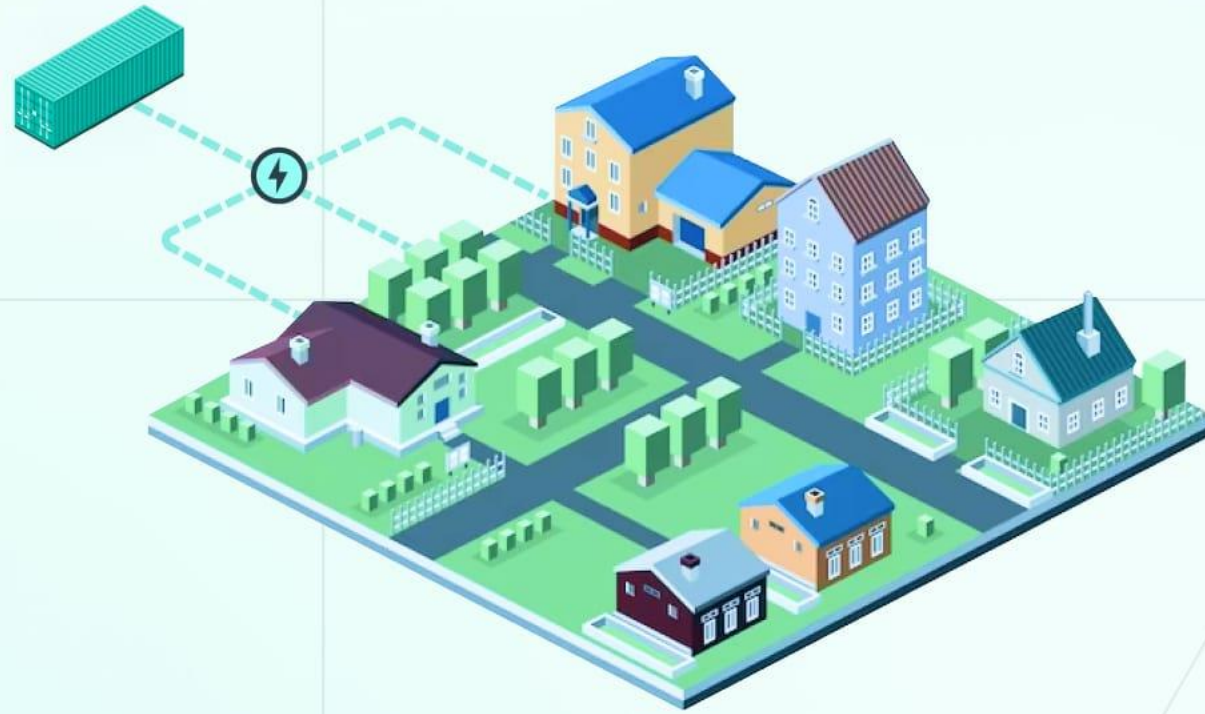
Power to Grid