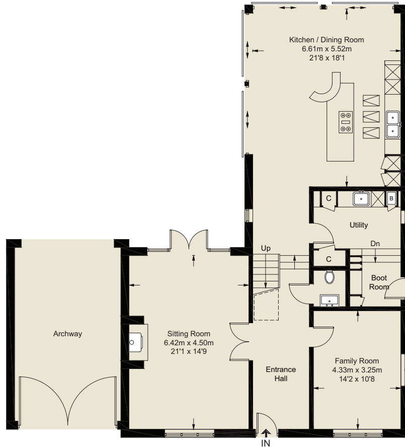
Ground Floor (Excluding Garage) 116.9 sq m / 1258 sq ft