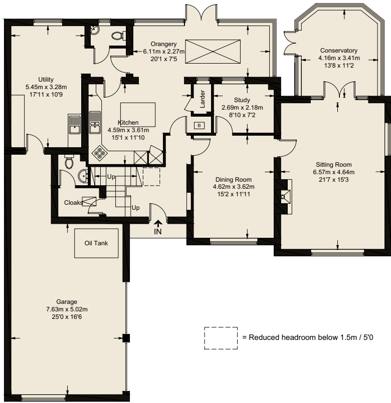
Ground Floor (Including Garage) 189.6 sq m / 2041 sq ft