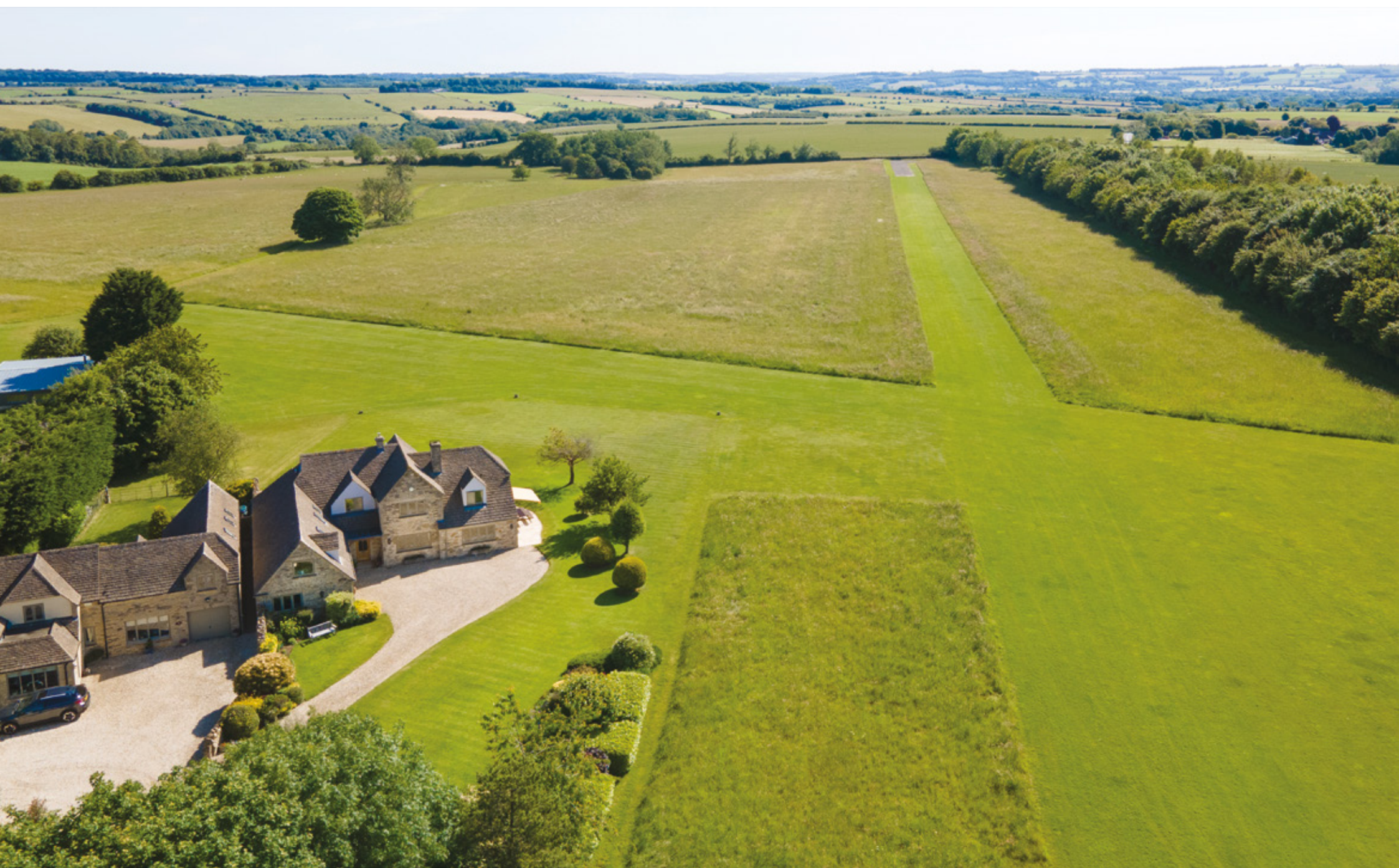
2 Upland House