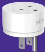
On/Off Plug-In Switch

Thank you for purchasing the DOME On/Off Plug-In Switch, which works with your Z-Wave Certified Controller to turn on and off any plugged in electronic device and monitor its power consumption.