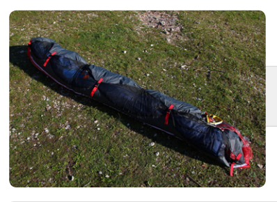
Step 9. Turn the Saucisse on its side and make the first fold just after the LE reinforcements. Do not fold the plastic reinforcements, use 3 or 4 folds around the LE.