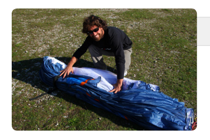
Step 5. Once the LE and rear of the wing have been sorted, turn the whole wing on its side.