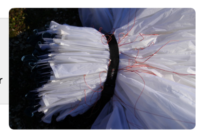
Step 3. Lay wing on its side and Strap LE...Note the glider is NOT folded in half; it is folded with a complete concertina from tip to tip. It is really important to not stress the middle cell or bend the plastic too tightly.