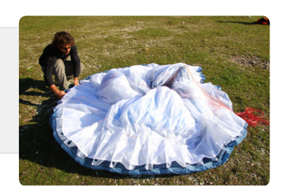
Step 2. Group LE reinforcements with the A tabs aligned, make sure the plastic reinforcements lay side by side.

Step 1. Lay mushroomed wing on the ground. It is best to start from the mushroomed position as this reduces the dragging of the leading edge across the ground.