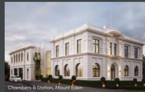
Chambers & Station, Mount Eden