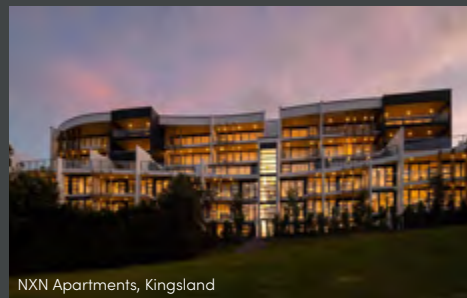
NXN Apartments, Kingsland