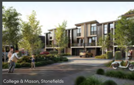
College & Mason, Stonefields