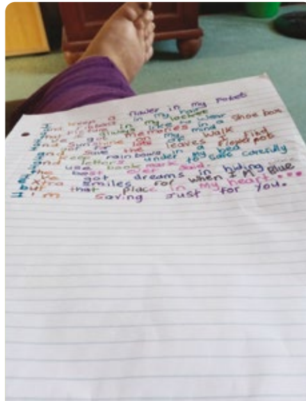
Cathy Boyle kept busy writing poetry and doing puzzles.