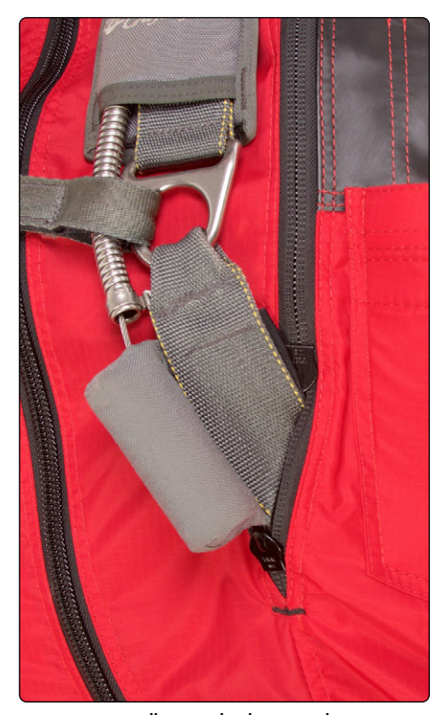
Handles completely exposed. Zippers tight against MLW.

We highly recommend using a standard pillow handle as the best choice for wingsuit flying. For more detailed information on the decision of what handle type is best, please see our Reserve Handle Information PDF here: <a href="http://squirrel.ws/handles">http://squirrel.ws/handles</a>