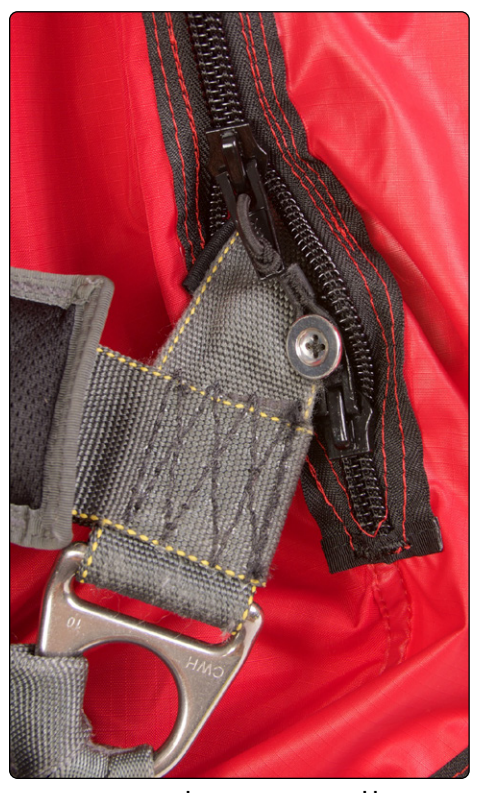
Keep zippers close against MLW webbing.

The bungees that hold the zippers tight to the main lift webbing (MLW) of your harness must always be connected. DO NOT jump your suit without the zipper bungees set tightly around your harness MLW. Securing the bungees on the inside of the MLW usually results in the zippers being closer, and the hole being smaller.