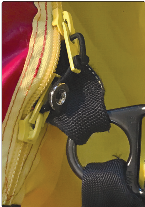
Keep zippers close against MLW webbing.

The bungees that hold the zippers tight to the main lift webbing (MLW) of your harness must always be connected. DO NOT jump your suit without the zipper bungees set tightly around your harness MLW. Securing the bungees on the inside of the MLW usually results in the zippers being closer, and the hole being smaller.