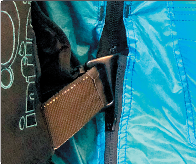
Lateral Pass-Through back view.