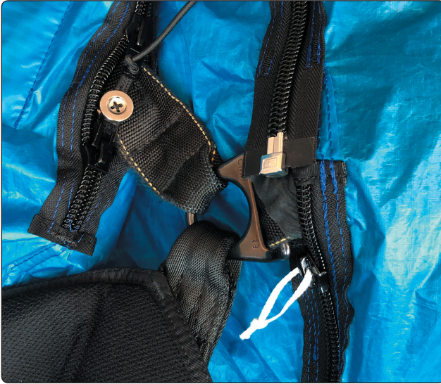
Lateral passes through inside.

When you place your leg strap inside the suit, pass your harness lateral between the zippers. You can zip the bottom slider (it has a spectra loop on it) up until it touches the bottom of your lateral.