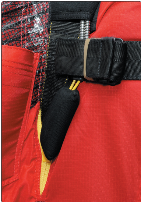
Handles completely exposed. Zippers tight against MLW.

NOTE: If you think that the zipper system is not functioning well with your skydive harness (i.e. your emergency handles are not always 100% accessible), please contact us immediately before your next jump. You may need to modify the zippers so that the sliders stay locked in place, as per the information at this URL: http://squirrel.ws/zipperstuff