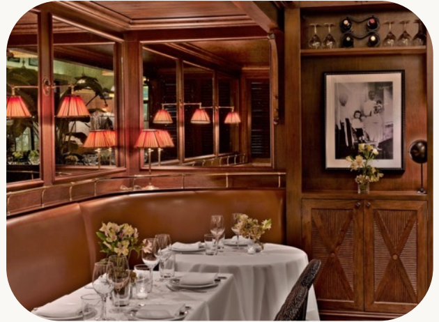
Houston EST 2016