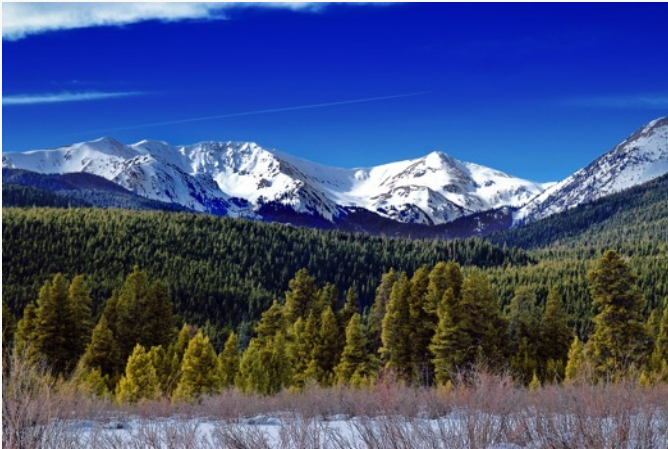
Cherry Creek EST 2024