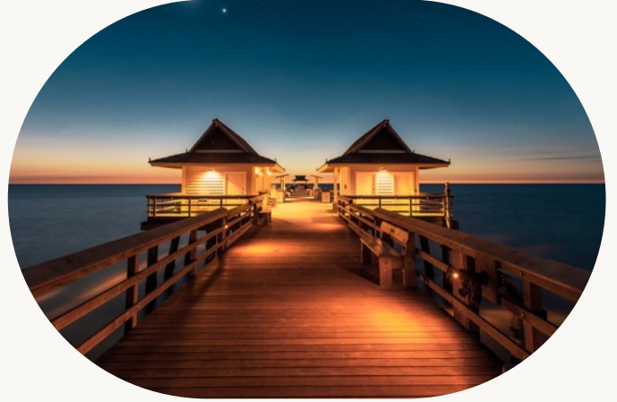
Naples EST 2023