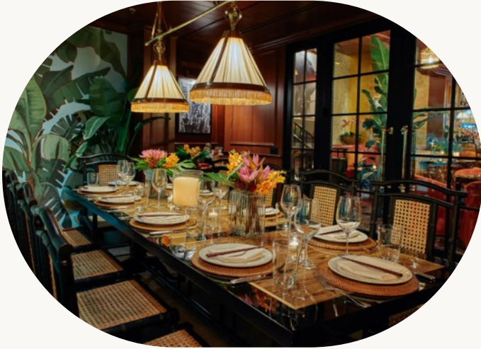
Chicago EST 1996