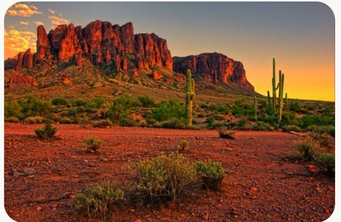
Scottsdale EST 2024