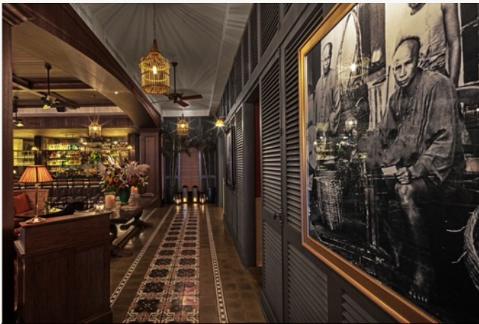
Atlanta EST 2019