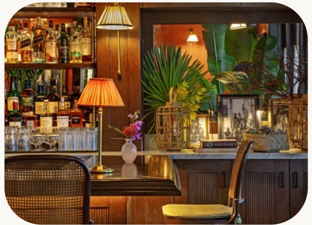
Lake Forest EST 2022