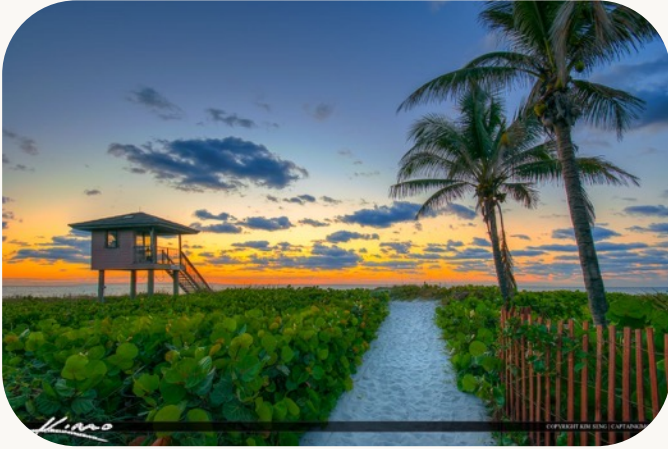
Delray Beach EST 2023