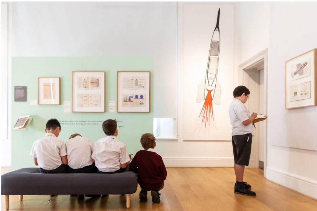
Exhibition workshop

Find out more about our offer here and sign up to our teacher mailing list here .