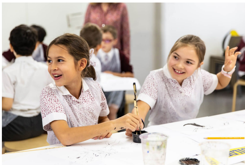
School Workshop

As the national charity for illustration, we're inviting everyone to celebrate the pictures that are part of our lives and the brilliant people who make them.