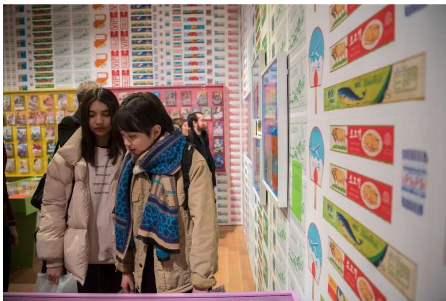
Made In North Korea

We need to secure £2mn in match funding to unlock the National Lottery Heritage Fund grant and begin construction (target start date early 2024). We will then begin a second phase of the Campaign (an additional £2.5mn) which will run until 2026.