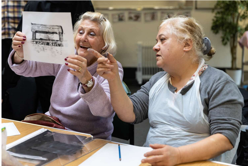
Our Clerkenwell illustrated map project © Rob Harris