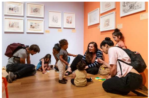
Left to right: Designed In Cuba, Early Years workshop