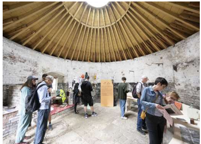
New River Head Engine House and Windmill Base