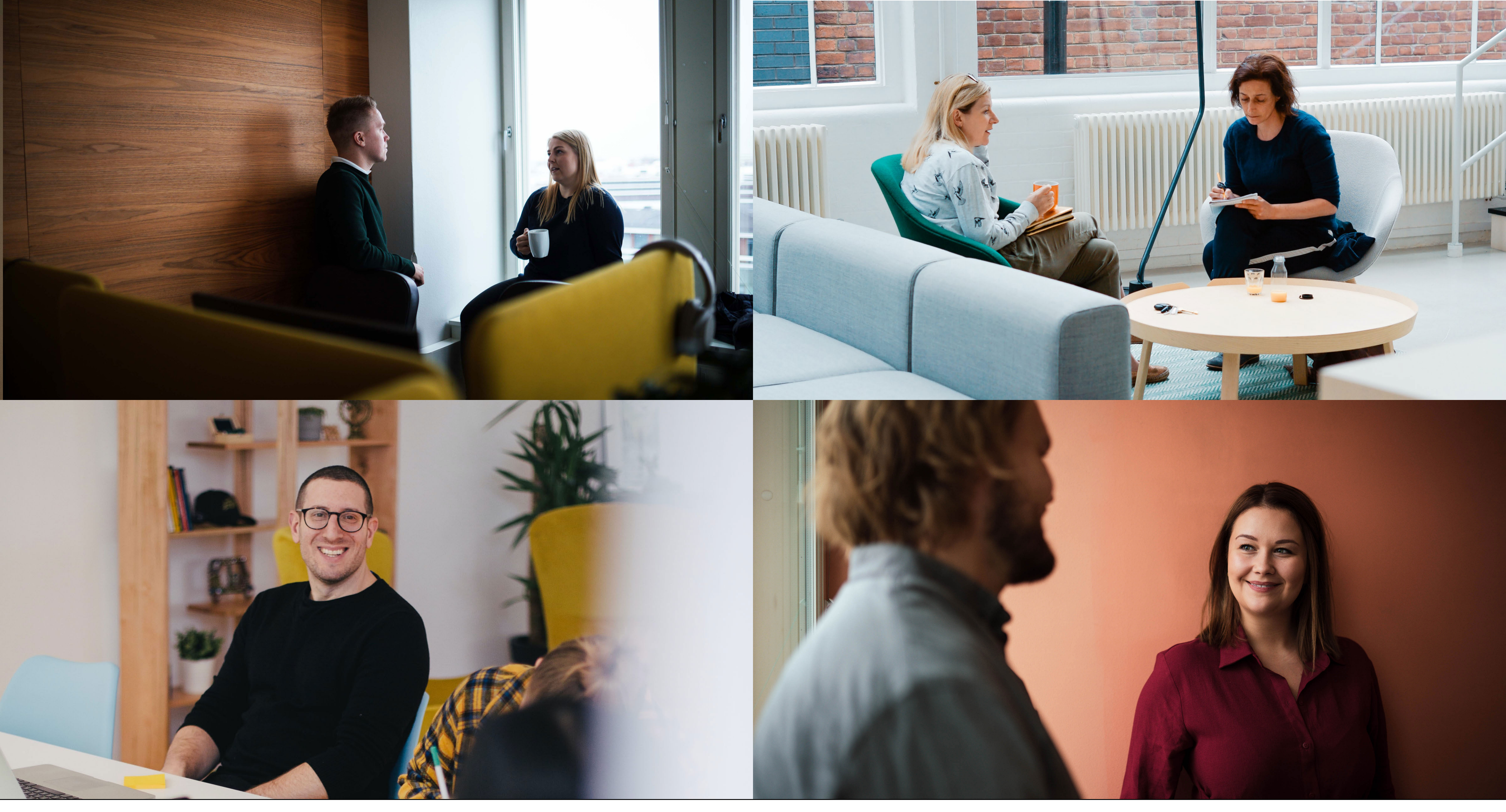
Brand Guidelines – Brand images