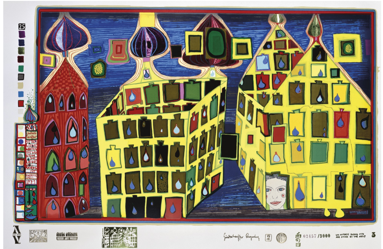
Friedensreich Hundertwasser Waiting with love hurts when love is somewhere else, colour serigraphy, 1971/1972. © 2023 NAMIDA AG, Glarus, Schweiz

As early as 1970, he wrote the 'Peace Treaty with Nature'. Ecological appeals became his main artistic activity. In addition to his painterly, graphic and architectural works, he created three large-scale biotopes and planted hundreds of thousands of trees there. The areas in France, Venice and New Zealand are still preserved today.