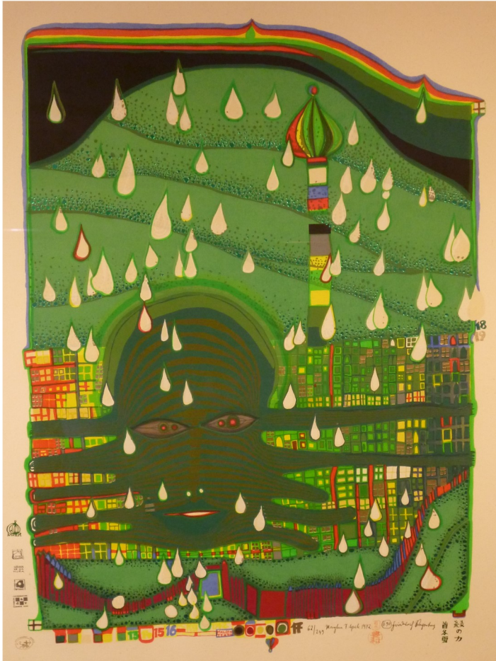
Friedensreich Hundertwasser Green Power, Colour serigraphy, 1972.

Friedensreich Hundertwasser is one of the most popular European artists of the 20th century. His works are characterised by bright colours, spiralling lines and natural forms that reveal a unique visual language and an extraordinary sense of form and colour. They arose mainly from the artist's impulse to show in his painterly, architectural and landscape work that nature can be regenerated and recreated if one follows the rule that what is beautiful is natural and vice versa. As early as the 1960s, he asked himself how art could contribute to environmental protection and the balance between humans and nature.