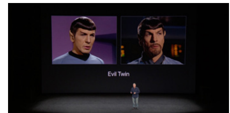
Apple presenting "twin test" in 3D facial recognition at iPhone X keynote, 2017

While advancements in user experience and user interface design help these products function with magical ease, they are undergirded by intensely coordinated surveillance and data-tracking software. Tech companies monitor their users' personal information and actions to refine their products so they can predict their customers' desires with high degrees of specificity, while also selling that data to advertisers. But, while much of this information is voluntarily surrendered—our locations, interests, ages, relationship statuses, etc.—the depth of surveillance and the lengths to which companies such as Facebook will go to acquire data, for instance by cribbing information without our knowledge via our friend networks, or even buying personal information from credit report companies, is largely unrecognized. 5 Personal data becomes even more profitable as a commodity when user profiles include economic, ideological and political traits. The results are commonly applied to micro-targeted advertising.