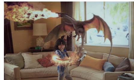
Promotional image of Magic Leap's augmented reality technology, 2017

Some still acknowledge Steganographia as having mystical foundations and underlying theological motives. Trithemius conceived of cryptography as a "secular consequence of the ability of a soul specially empowered by God to reach, by magical means, from Earth to Heaven." 13 We won't ever know (and couldn't understand in contemporary terms anyway) Trithemius' personal beliefs—for instance, if he truly considered ciphers divine supernatural expressions, or if he used the rhetoric of magic and religion as an entry point to cryptography. Regardless, after all these years, Steganographia has acquired new relevance, as encryption has become fundamental to communication, from the compression of messages into proprietary languages, to tools deployed by tech companies to keep intellectual property hidden and unavailable to competitors in order to maintain their power. Steganographia will likely continue to enjoy new interpretations and be redefined over time, particularly as we cede agency to uniquely opaque processes, putting faith in entities whose nature is just now coming into focus.