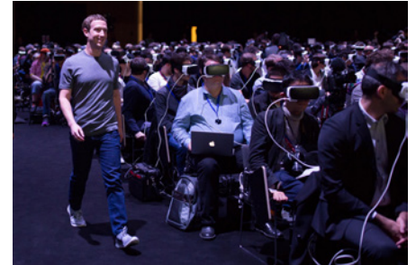
Mark Zuckerberg at Samsung Galaxy S7 launch, 2016