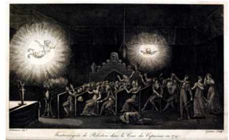
Phantasmagoria at the Cour des Capucines, 1797; as it appears in E.G. Robertson, Mémoires récréatifs, scientifiques et anecdotiques du physicien-aéronaute, 1831

Similar tensions surrounded proto-scientific endeavours. Though there